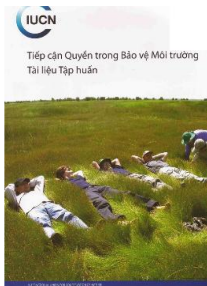
Training manual on the human-rights based approach to environmental protection

the delivery of the curriculum (through co-authorship), the project grantee aspired to increase support and demand for civil society participation among senior government officials and thus to improve the enabling environment for local environmental NGOs.