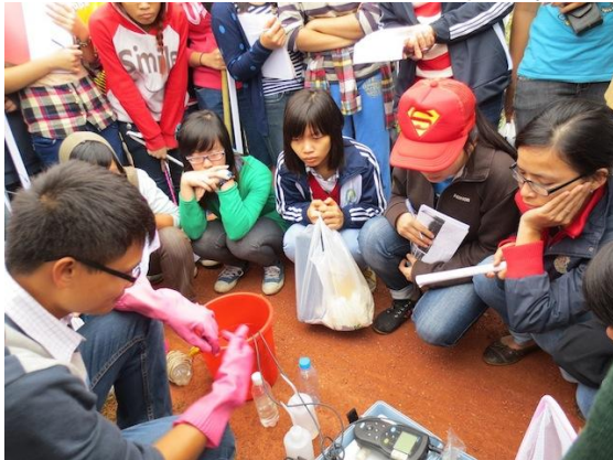
CECR's Youth Leadership Project with IUCN assistance helped young people to analyze pollution levels in various lakes of Hanoi

Following IUCN's interest and capacity survey, the Center for Environment and Community Research (CECR) was given the opportunity to develop its internal technical capacity by obtaining training in financial management, control and reporting for NGOs. In addition, UNDEF-funded support helped CECR to (i) implement a "Youth leadership training project", which monitored pollution levels in selected of Hanoi's many lakes (i.e. purchase of water analysis tools, equipment and survey resources); (ii) launch a lake protection website and support its communication officer administrating the website. CECR's director vis-à-vis the evaluators described the assistance as