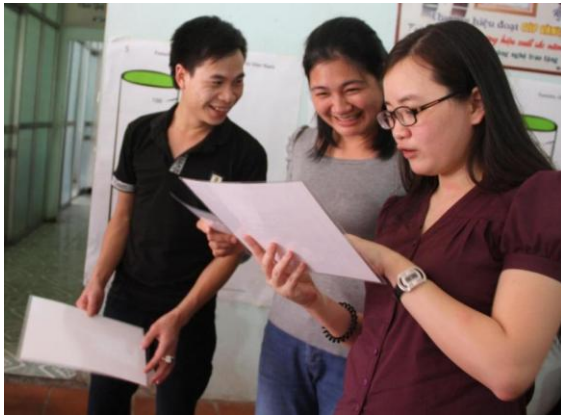
Participants of the Media Training on Sustainable Forest Management, which was supported by implementing partner CIFOR

from across a variety of disciplines has started to make use of the manual, as and when appropriate. However, evaluators have noted that the grantee (upon UNDEF recommendation) during the project's extension period organized two additional workshops to provide local NGOs with the opportunity to demonstrate the practical benefits of their environmental protection work to 88 officials (representing different levels of governance similar to the groups of participants above) and to directly discuss with them the barriers they face when trying to support civil society participation.