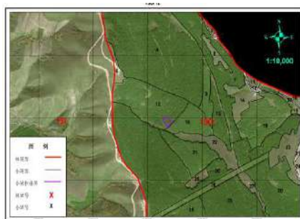
Figure 12: Tending operation designing of Mulan SFF in Hebei Province