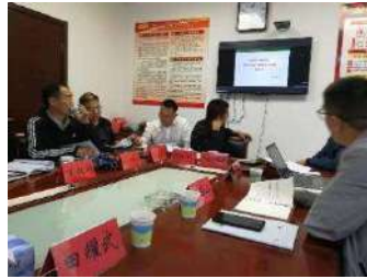
Figure 9: symposium on the preparation of the “FLR plan of Fengning County”