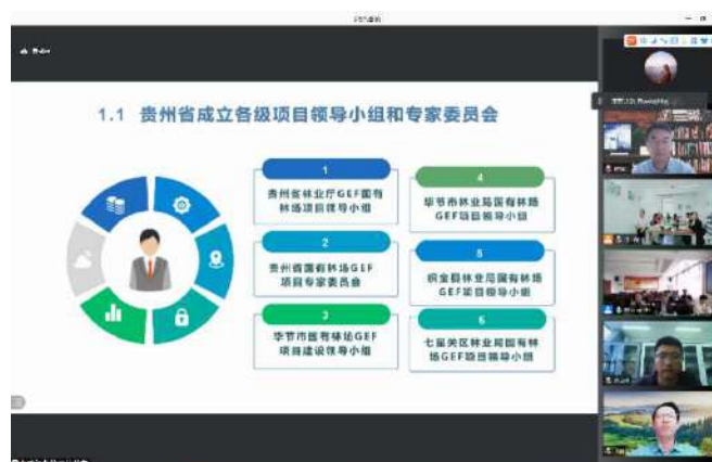
Figure 5: Online exchange meeting on project progress of Guizhou Province

On August 27, 2021, the exchange meeting on the mid-term progress report of project implementation in Guizhou Province was held. People from National project management office, provincial project management office, Forestry Bureau of Bijie city, two state forestry farms and provincial experts attended the meeting, totally 19 participants.