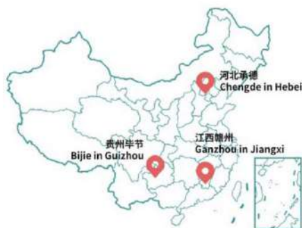
Figure 1: Project implementation areas.

state forest farms are selected as the main body (Table 1), which belong to the warm temperate zone, middle subtropical zone, and the northern subtropical zone. The critical ES cover four categories: provisioning, regulating, cultural and supporting, including biodiversity, water conservation, soil conservation, wind prevention and sand fixation, timber reserves, carbon fixation and oxygen release, landscape-based recreation, and forest-based health rehabilitation.