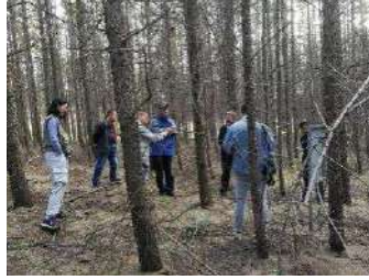
Figure 8: Tending and thinning sample plot of larch plantation