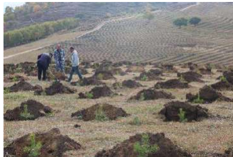
Figure 11: Degraded Forest restoration of Caoyuan SFF in Hebei Province