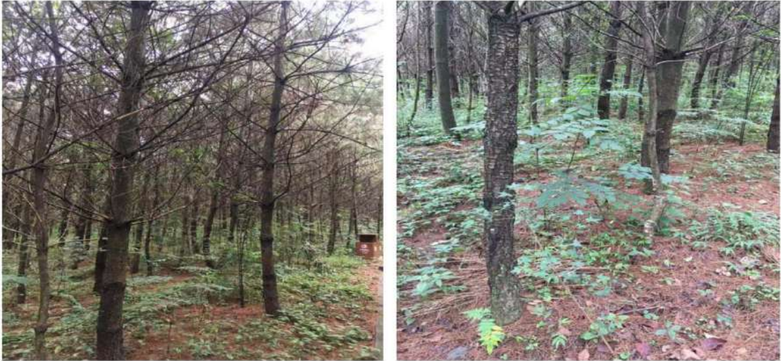
Figure 10: Replanting Acer truncatum in the Pinus armandii forest of Gonglongping SFF in Guizhou Province