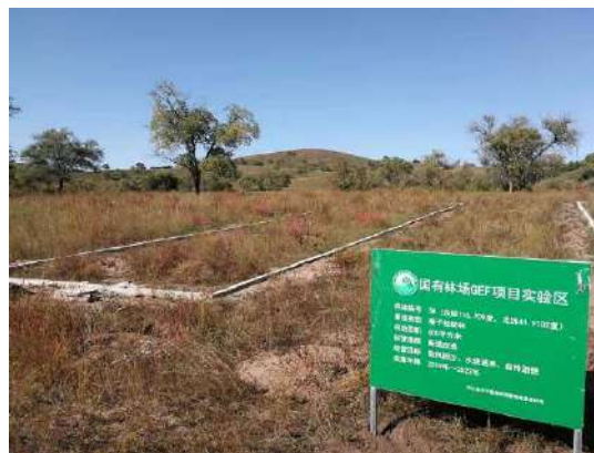
Figure 14: Monitoring runoff field of Caoyuan SFF in Hebei