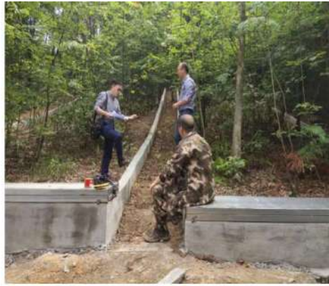
Figure 13: Monitoring runoff field of water and soil conservation in Gonglongping SFF in Guizhou