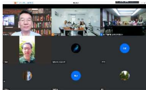
Figure 7: Online exchange meeting on project progress of Jiangxi Province

On September 3, 2021, the exchange meeting on the mid-term progress report of project implementation in Jiangxi Province was held. People from National project management office, provincial project management office, Forestry Farm and Seedling Division of Jiangxi Provincial Forestry and Grassland Bureau, Forestry Bureau of Fengning County, two state forest farms, and provincial experts attended the meeting. In total 20 participants.