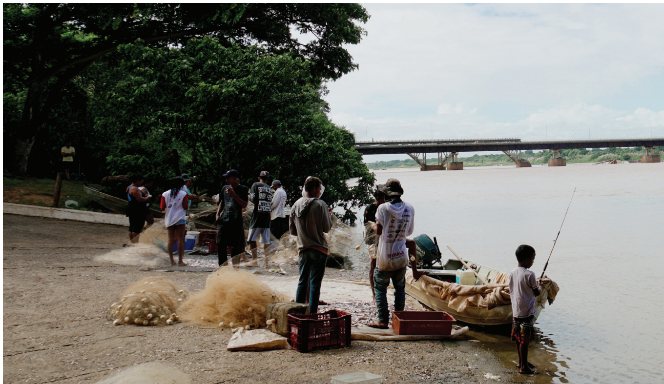
Fishers in Linhares, Espírito Santo, Brazil, 2019.