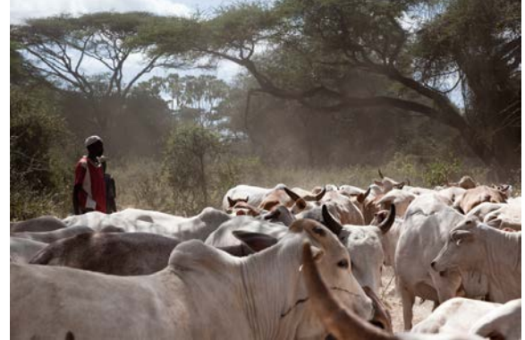
Boran pastoralist with his cattle in northern Kenya

Livestock farmers (pastoralists) depend on drylands resources such as grasslands and seasonal ponds to nourish their livestock. Sustainable pasture management through managed herd mobility can prevent degradation and sustain livelihoods. For example, the practice of Hima in Jordan takes into account the seasons and life cycle of grasses to prevent overgrazing by livestock herds, which also transport fertile seeds around the landscape. Governments can institute appropriate policies and grant rights to local communities to sustain these traditional practices. For example, grazing lands can be recognised as protected areas, to prevent their conversion to other land uses.