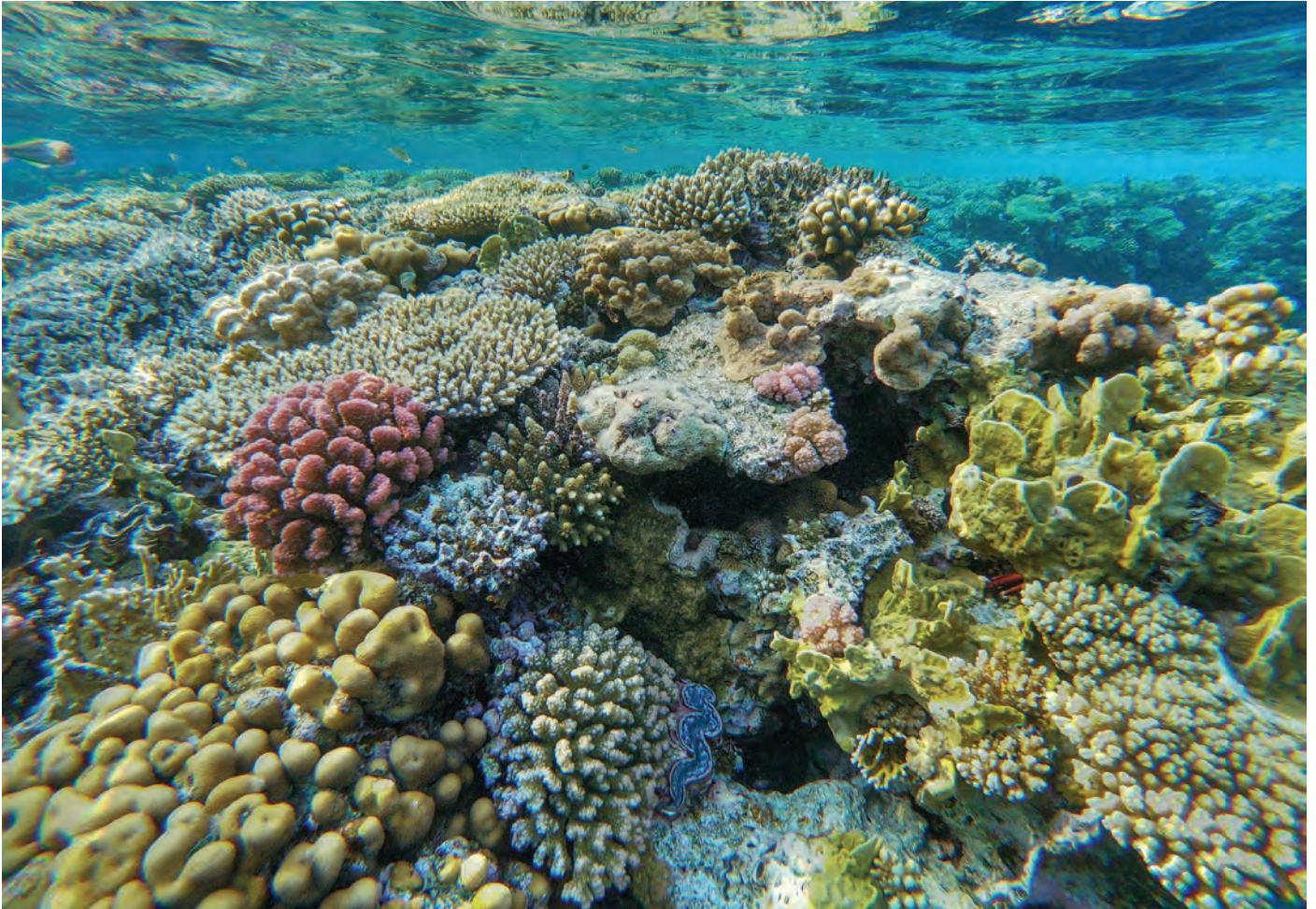
▲ Corals are thriving inside Ras Mohammed National Park, Egypt, an IUCN Green Listed protected area. | GREGOIRE DUBOIS