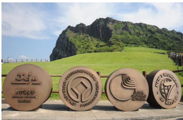
Seongsan Ilchulbong, Korea: a spectacular tuff cone formed by hydrovolcanic activity on a shallow seabed about 5,000 years ago. It forms part of Jeju Volcanic Island and Lava Tubes Natural World Heritage Site and Jeju Island Global Geopark. It also supports a number of rare plant species and is an important tourist attraction.

Geoheritage is a non-renewable heritage which can provide significant information on the history of the Earth and ongoing-related processes. The story of the Earth, our geoheritage, is preserved in its geodiversity. Put simply, geodiversity is the variety of rocks, minerals, fossils, landforms, sediments, water and soils, together with the natural processes which form and alter them. Plate movements, volcanic activity, ice ages, mountain building, environmental changes and the evolution of life are all recorded in varying detail in rocks, landforms, sediments, fossils and soils and enable us to understand the evolution of our dynamic planet. Geoheritage is a vital link between people, nature, landscapes and cultural heritage. It supports sustainable management of land and water, climate change adaptation, historical and cultural heritage, economic development and people's health and well-being through providing assets for outdoor recreation, (geo)tourism and enjoyment of the natural world. Geodiversity also provides the foundation for life on Earth and the diversity of species, habitats, ecosystems and landscapes. Without an understanding of geodiversity, management of protected areas will not be as effective as it should be. Thus, conservation of geodiversity is necessary both for its own particular geoheritage values and for its wider ecosystem values as well. This requires better integration of geodiversity and geoheritage into the management of protected areas.