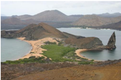
Galapagos National Park and World Heritage Site, Ecuador: modern geological processes provide a basis for biodiversity abundance. (Photo: ©Roger Crofts).

A third reason is its important cultural heritage role. For example, depiction of mountains on national flags, caves with early paintings of life and value for aesthetic reasons and for recreation and tourism activities.