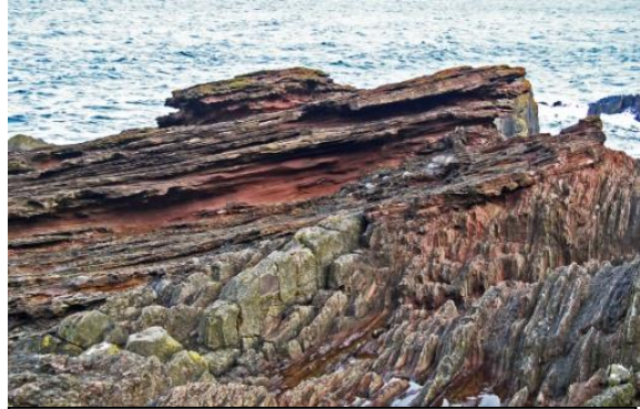
James Hutton's classic section at Siccar Point, Berwickshire, Scotland, showing the unconformity between steeply dipping Silurian strata and overlying Devonian (Old Red Sandstone) rocks.

Protecting geoheritage as a scientific and educational resource is the second reason. There are many sites that have proved to be formative in our knowledge of the evolution of the Earth. For example Hutton's unconformity at Siccar Point, Berwickshire, Scotland demonstrates the vast gaps of time between different rock layers and the Burgess Shale in British Columbia, Canada, provides exceptional insights into the evolution of complex life forms on Earth over 500 million years ago. And we need to ensure that we retain opportunities for future generations to apply new ideas and seek new evidence.