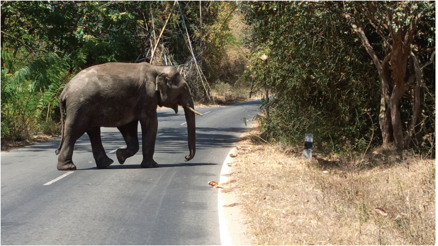
Elephant NH-209 in BRT Tiger Reserve, India