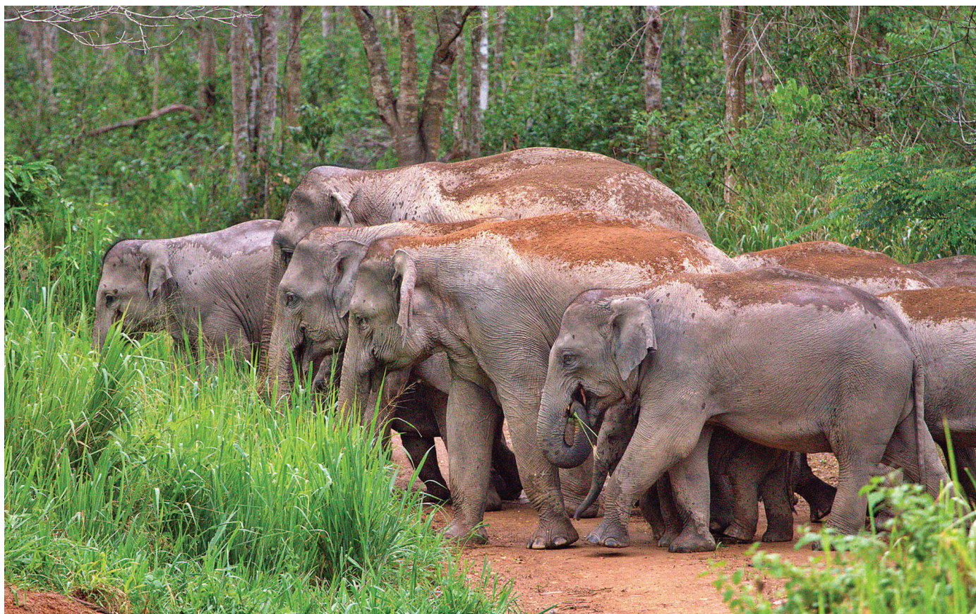
Elephant herd in Thailand forest