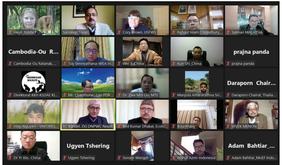
Asian Elephant Range State preparatory meeting with all 13 Range Country officials