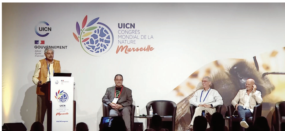
The Chair at WCC