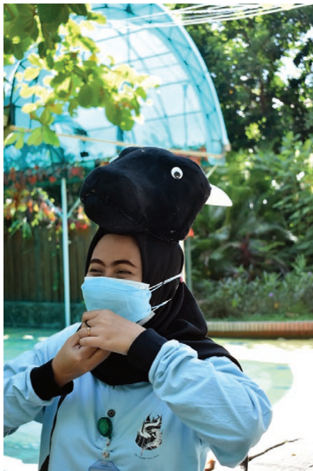
Surabaya Zoo staff wearing anoa doll for ice breaking