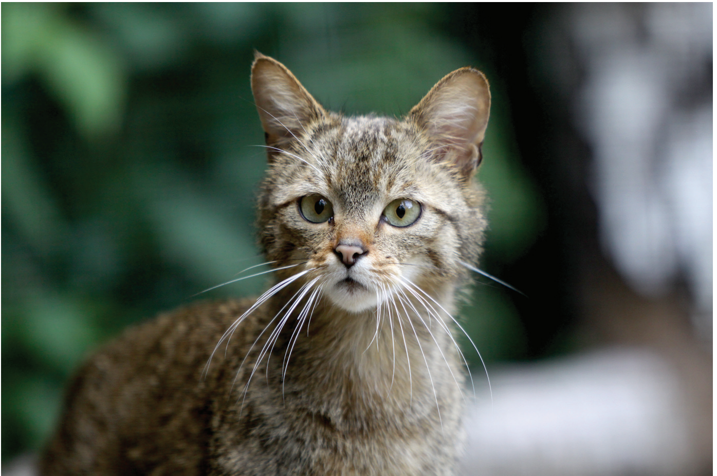
European Wildcat ( Felis silvestris )

Result description: The workshop to develop the Regional Conservation Strategy has been postponed to March 2022.