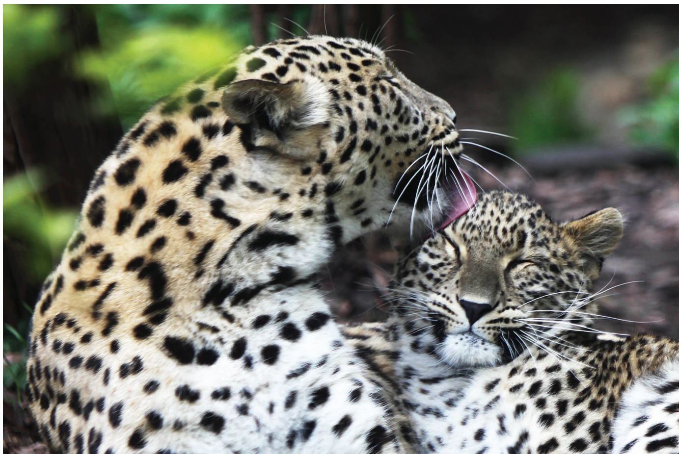
Persian Leopard ( Panthera pardus tulliana)

T-058 Establish and maintain the Wild Cat Club as a group of non-members to support the work of the Cat Specialist Group.