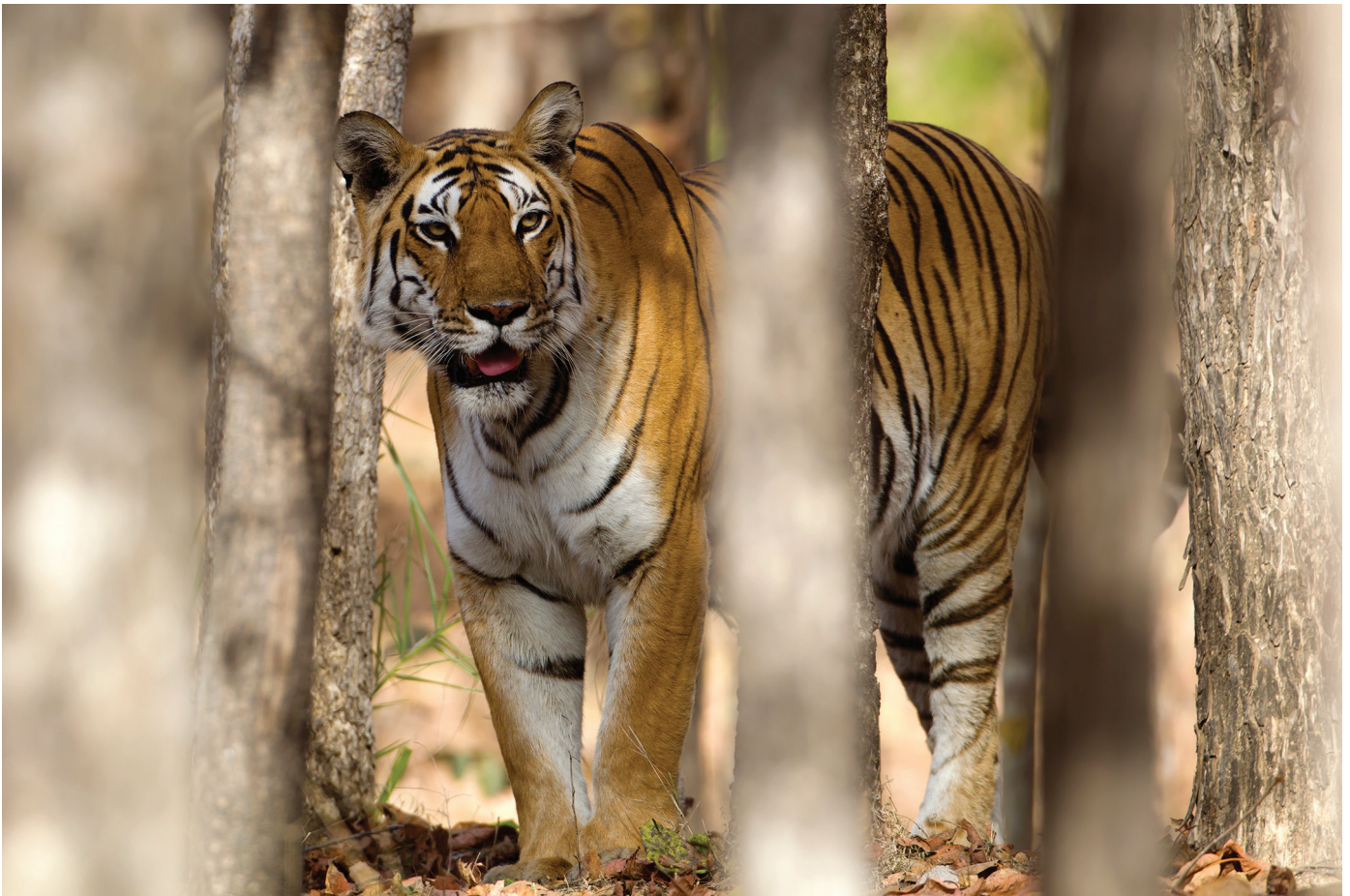
Tiger ( Panthera tigris) in Pench National Park, India

spirit of the group, inform about news and/or issues, and provide the opportunity to ask questions to the Co-Chairs and group members.