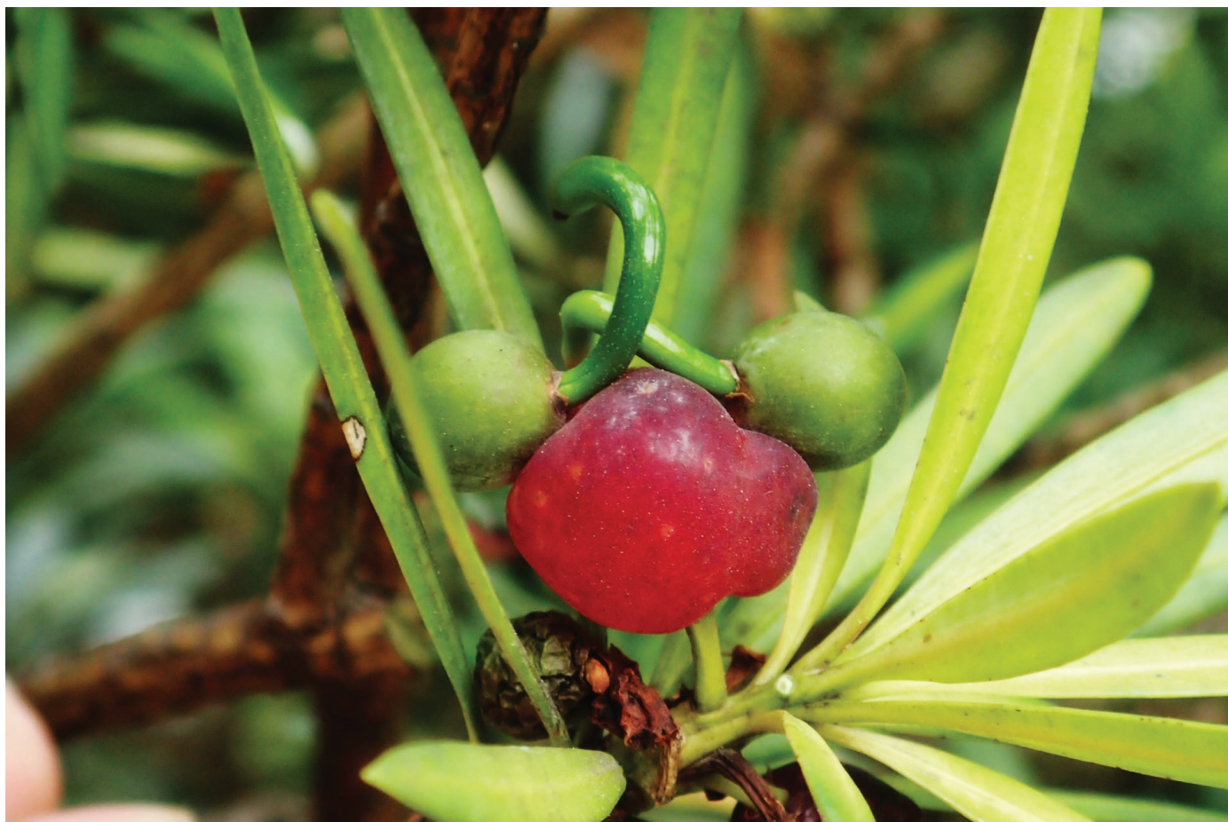
Fruit of Least Concern Buddhist Pine, Podocarpus macrophyllus Photo: Yong Yang