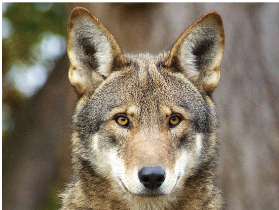
Critically Endangered Red Wolf ( Canis rufus )