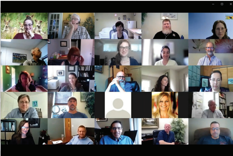
Red Wolf Recovery Planning Workshop, Day 1: 31 August 2021