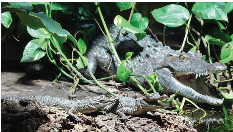
Adult Philippine Crocodile ( Crocodylus mindorensis ) with hatchlings at Cologne Zoo, Germany

T-019 Assess the impact on crocodylian conservation efforts by various NGOs to curtail all trade in wildlife to meet ideological goals outside the mission of both SSC and IUCN.