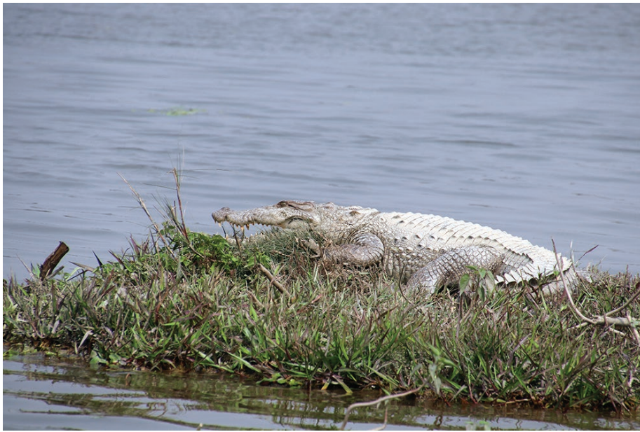
Mugger Crocodile ( Crocodylus palustris )