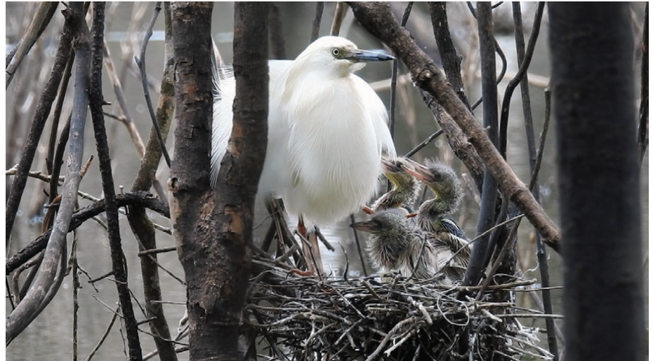
Endangered Madagascar Pond-Heron ( Ardeola idae ), with chicks