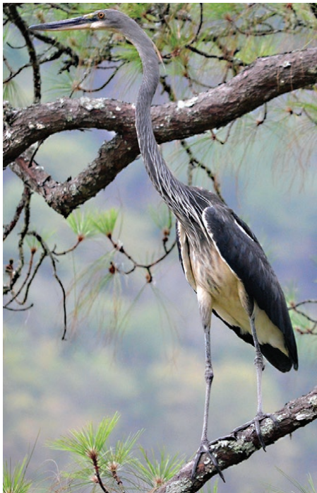
Critically Endangered White-bellied Heron ( Ardea insignis ), in Bhutan