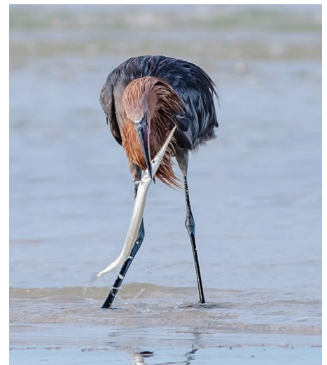
Near Threatened Reddish Egret ( Egretta rufescens ), with captured needlefish in Florida Bay, US

Result description: We continued to promote the journal and solicit publications. The journal published three papers in 2021, with an expectation to double that output in 2022.