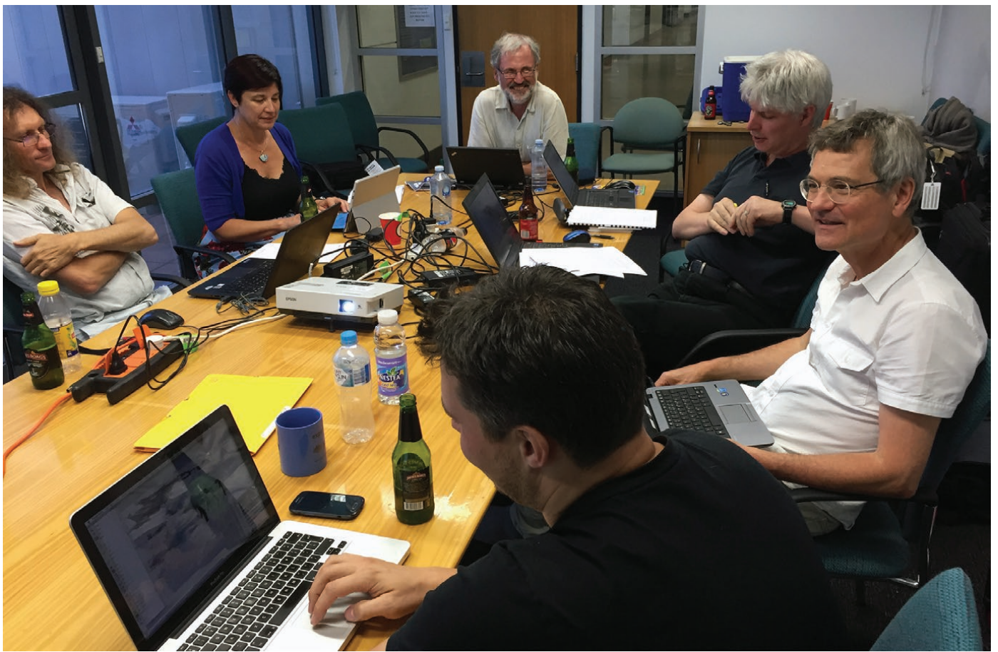
Standards and Petitions Committee at a meeting in November 2015 at the University of New South Wales, Sydney, Australia