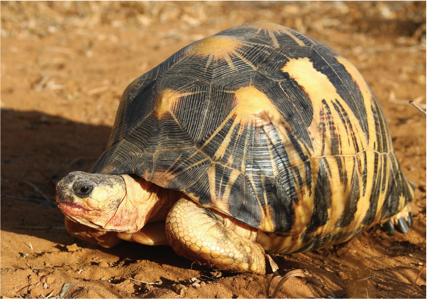
Critically Endangered Radiated Tortoise ( Astrochelys radiata ), Madagascar