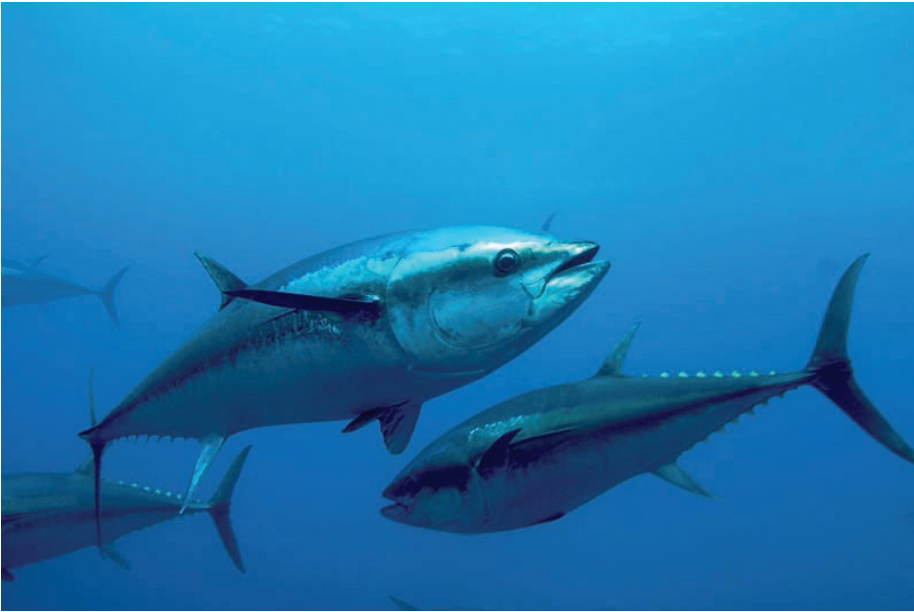
Bluefin Tuna, Mediterranean Sea