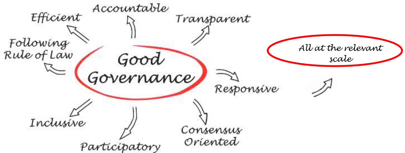
Fig 2. Good Governance for the rangelands at the landscape scale

hydro-power via the King Talal dam. Rangeland restoration safeguards this water supply whilst also reducing sedimentation of the dam.