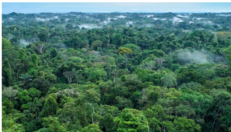
Example of a carbon-rich, high biodiversity tropical rainforest Yasuni National Park, Ecuador

Likewise, The United Nations Convention on Biological Diversity (CBD) recognized the importance of the climate change/biodiversity nexus 4 , including in the Kunming Declaration from COP15 Part 1, 2010 Aichi Biodiversity Targets (targets 10 and 12) and the draft Post 2020 Global Biodiversity Framework (GBF) (targets 2, 8 and 11). A nature-positive world, as promoted by the 95 country signatories to the Leaders Pledge for Nature , embodies this collective understanding of the interdependence of biodiversity loss, ecosystem integrity, climate change impacts and human well-being.