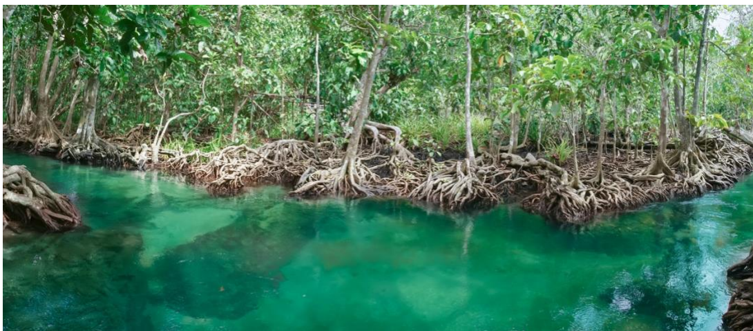
Example of a carbon-rich, high biodiversity mangrove forest Krabi, Thailand.

All pathways to attaining the Paris Agreement target of limiting average global temperature increases to 1.5°C of pre-industrial levels require protecting the global carbon sinks and reservoirs in natural ecosystems, in addition to rapid and drastic declines in GHG emissions. One fundamental and well-recognized tool is the protection of carbon-rich ecosystems such as primary forests, peatlands, grasslands, coastal blue carbon and marine biota, as well as the restoration of lost and damaged terrestrial, freshwater, coastal and marine ecosystems. These ecosystems are often referred to as ‘carbon-rich’ because they sequester and store more carbon than other ecosystems.