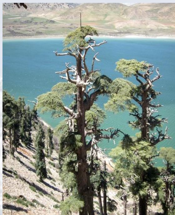
Atlas cedars on the slopes of Lake Sidi Ali, Middle Atlas, Morocco, showing signs of tree crown dieback

If you are researching similar questions for other species/ecosystems/regions, please do not hesitate to get in touch!