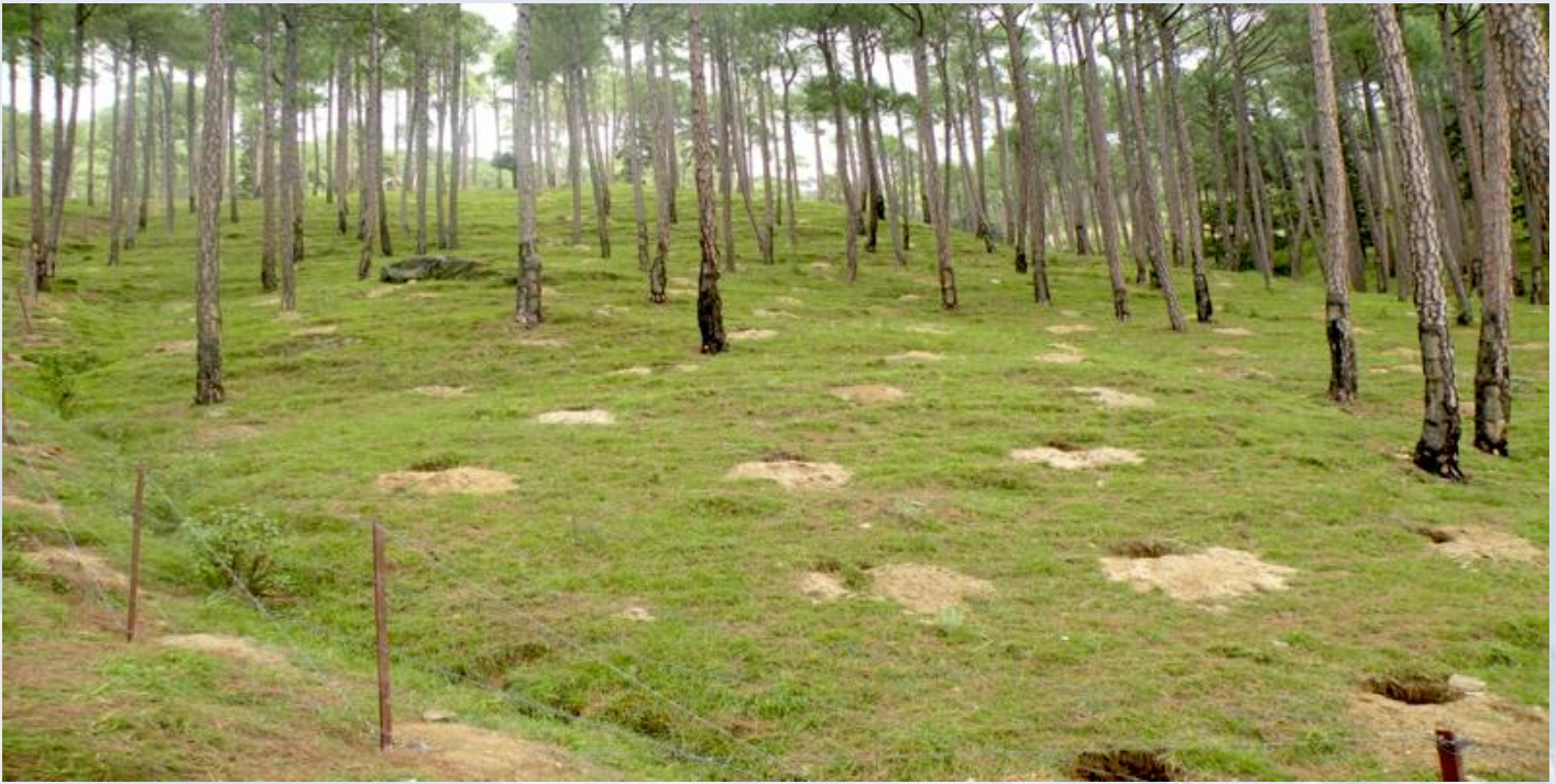
Nanda Van enrichment plantation site. Above: Freshly dug pits. Below: plantation in progress.