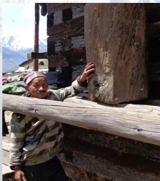
Bee keeper with traditional log hive

An investment in the next generation, the project engages farmers including young people and women, and develops their knowledge of important pollinators and bee flora. They are being trained in bee keeping, biodiversity and ecosystem services. Traditional bee keeping practices (wall and log hives), are being revived and modern new boxes for native bee species ( Apis cerana ) are being promoted. The project also engages everyday citizens and corporate employees as “citizen scientists” who assist in data collection and increase their knowledge of the importance of biodiversity and ecosystem services.