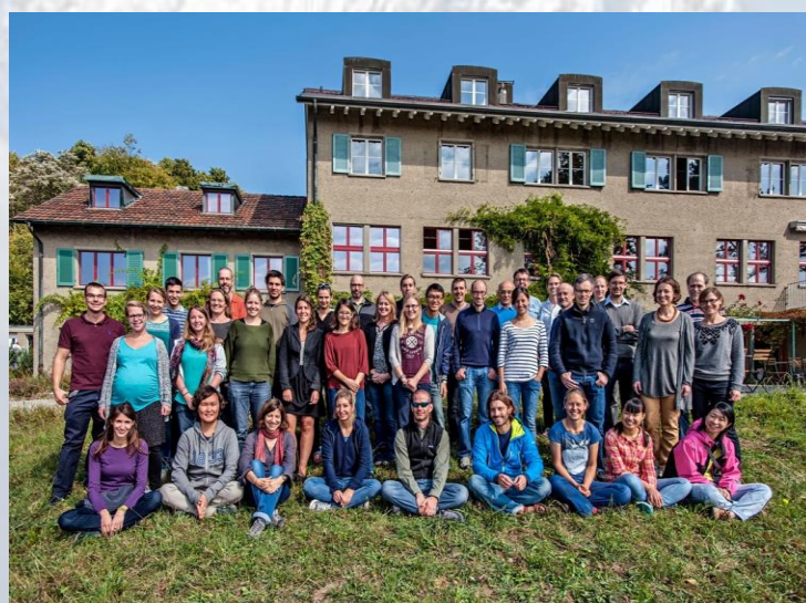
URPP Global Change and Biodiversity team group retreat

In September of this year, we will be hosting a poster session at the IUCN World Conservation Congress in Hawaii (session n°9858). With our poster we aim to: a) highlight the need for more integrative, culturally diverse and trans-disciplinary research projects, b) showcase our project internationally so others can benefit from our experience, c) connect with other scientists engaged in data sharing complementary efforts, d) reach out to a broader group of stakeholders, policy makers and the general public with new questions, challenges and solutions; creating new dimensions to our work. We encourage all of you at IUCN 2016 to visit our poster and get connected!