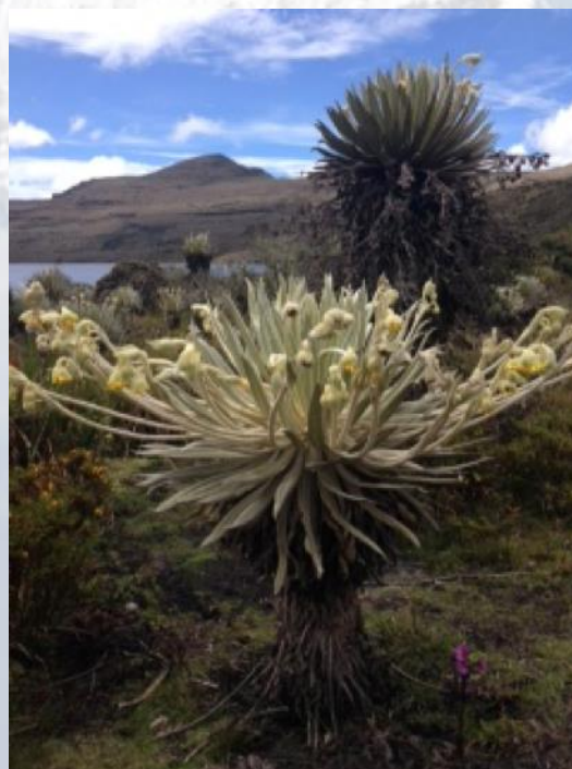
Páramo de Sumapaz, one of the project areas located at 3.900msnm

a basis for more effective hydrological management. The main knowledge products for this component include climate change scenarios downscaled reflecting changes in high mountain ecosystems and páramos, and vulnerability assessment of the high Andean ecosystems, above 2.600m to climate variability and climate change (1:25.000). In order to evaluate hydrological risk, this assessment gives special emphasis on socio-cultural and gender aspects affecting water management; and the "adaptive territorial structure". These knowledge products are currently under development.