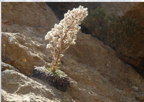
The rare Saxifraga longifolia

subsp. Atlantica ), holm oak ( Quercus rotundifolia ), cork oak ( Quercus suber ), red juniper ( Juniperus phoenicea ), cade juniper ( Juniperus thurifera ), pine ( Pinus halepensis and Pinus pinaster ), Thuja ( Tetraclinis articulata ), Atlas cypress ( Cupressus atlantica ) and the Argan tree ( Argania spinose ). Similarly, steppe ecosystems include Juniperus communis , Ceratonia siliqua , Stipa tenacissima , Artemisia spp. and spiny xerophytics ( Alyssum spinosum , Bupleurum spinosum , Erinacea anthyllis , Vella mairei and Cytisus balansae etc.) Interestingly, mountain flora comprises of 75% of Morocco's total flora.