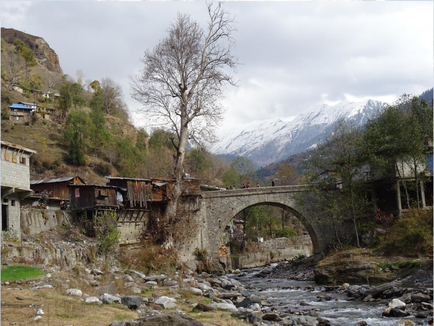
Siran Valley, North West Pakistan