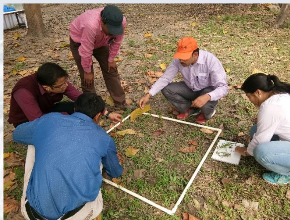
Teachers learning scientific methods of assessment

linking classrooms with environmental education. Eco-club teachers from various districts of Delhi participated in these sessions.