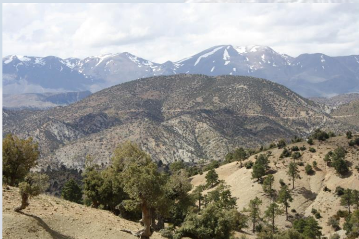
Eastern Middle Atlas mountain range

Morocco has 4 major mountain ranges. They cover almost 21% of the country's total surface area and are home to some 20% of the national population.