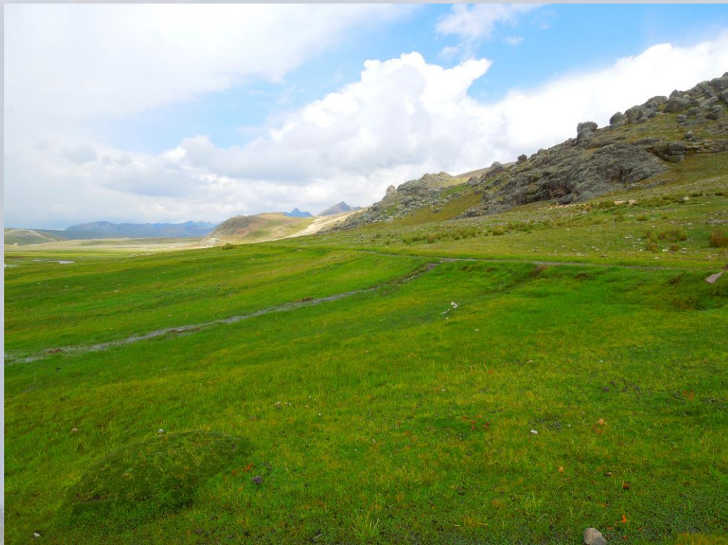
Cultural infrastructure in Tanta, Nor Yauyos Cochas Landscape Reserve