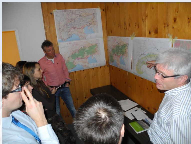
Delegates discussing green infrastructure during a recent AG-7 meeting

For more information about EUSALP and AG-7, please visit the AG-7 website .