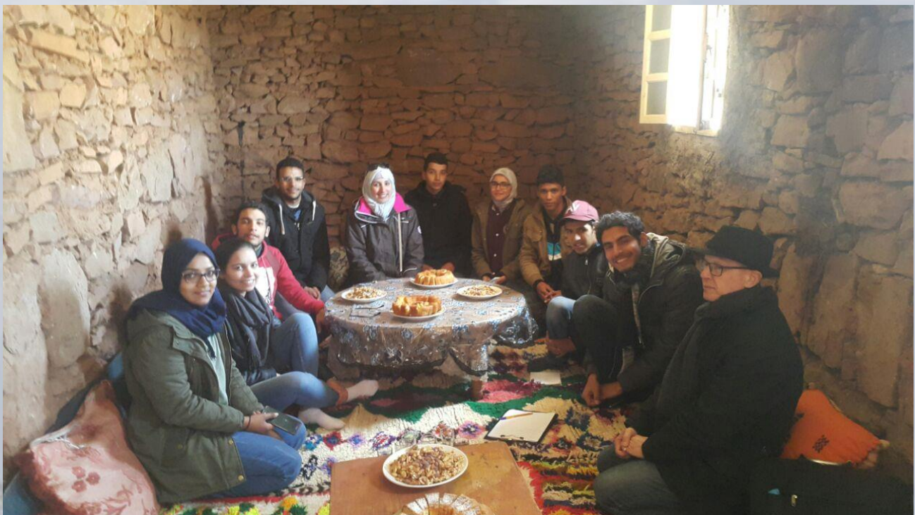
A meeting with mountain shepherds in a traditional Azib . We discussed their land management methods and the constraints they face