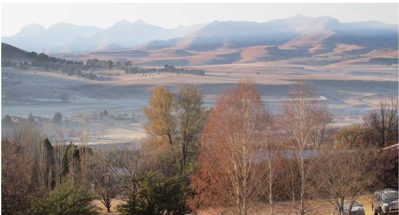
View of the Maloti Drakensberg mountains from a Free State border town in South Africa.

The various pressing issues faced by Lesotho (famines, political turmoil, and labour migration) are rarely covered in the mainstream South African media. Of greater concern, is that the