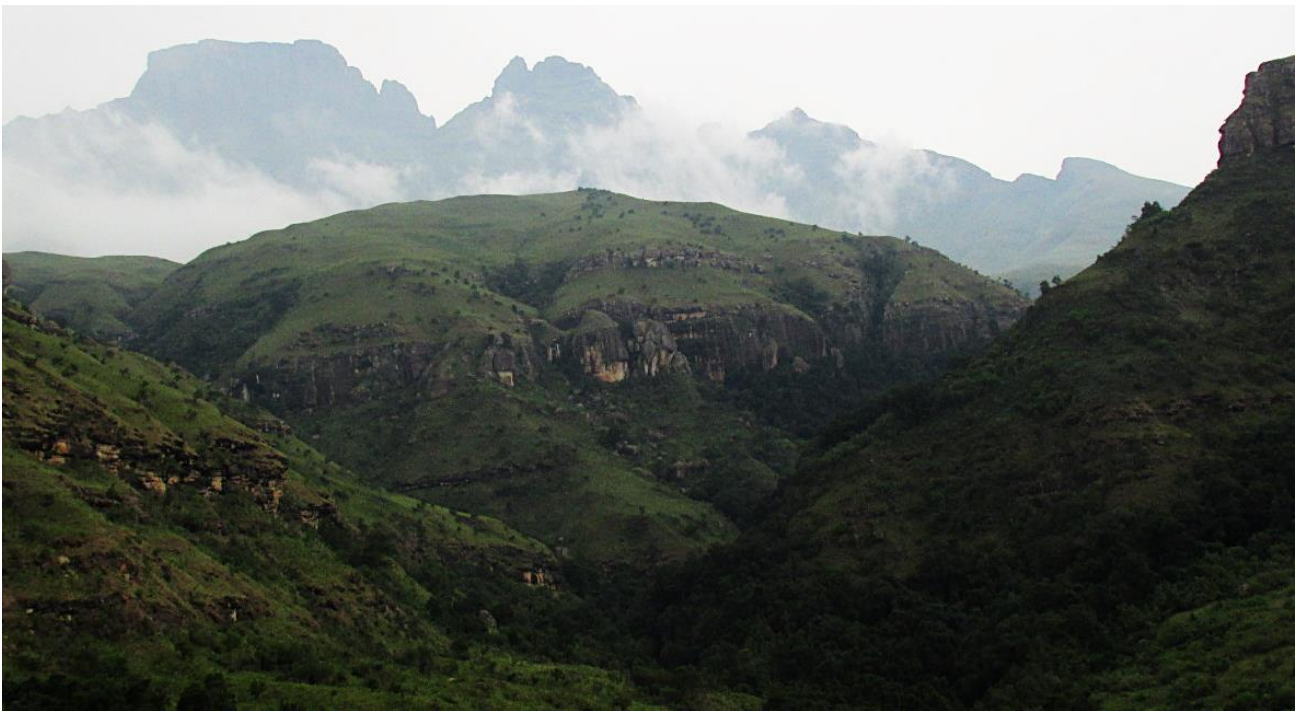
The majestic Drakensberg mountains that form the boundary between South Africa and Lesotho.