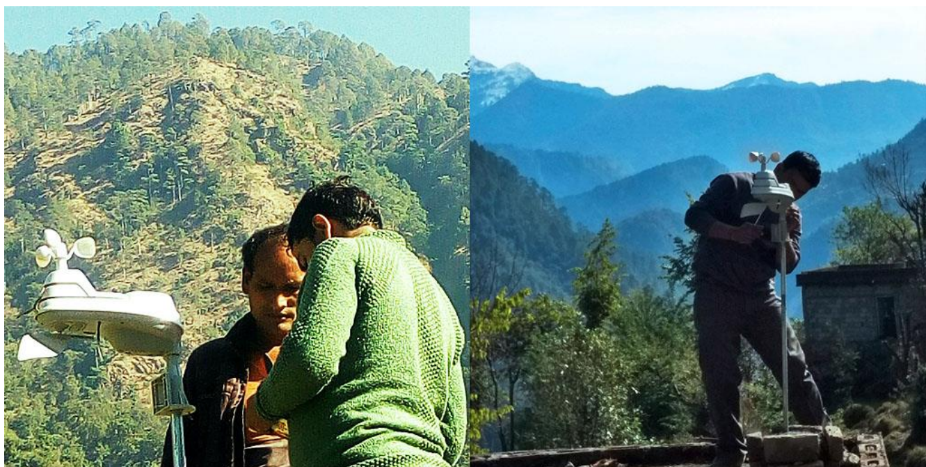
Grassroots weather monitoring stations set up in the Indian Himalayas to provide weather forecasts to farmers and to monitor changes in the micro-climate.

The pattern of migration varies across social groups, gender and has also evolved over the years. 13% households in the Indian state of Uttarakhand in the Central Himalayas report themselves as women-headed households (Awasthi and Devnathan, 2016) indicating highly gendered migration and work structure and rise of a 'money order economy.' However, the trends are still changing, and in the recent years, migrations to the plains have started to involve the entire families (Rawat, 2017), with the number of uninhabited or "ghost villages" increasing in these mountains. Social stratification also affects the migration pattern. Permanent migration is emerging as an important phenomenon amongst upper strata social groups for seeking a better quality of life and investing in their children's education. Our recent observations in the field also show that the intensity of outmigration is higher but seasonal or short term in nature among lower caste social groups who are marginal farmers with small plots of land with low productivity, compared to the higher caste farmers who own larger and more fertile parcels of land.