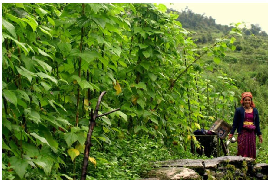
Glimpses from the indigenous food systems survey being conducted in Pithoragr, Uttarakhand, India.