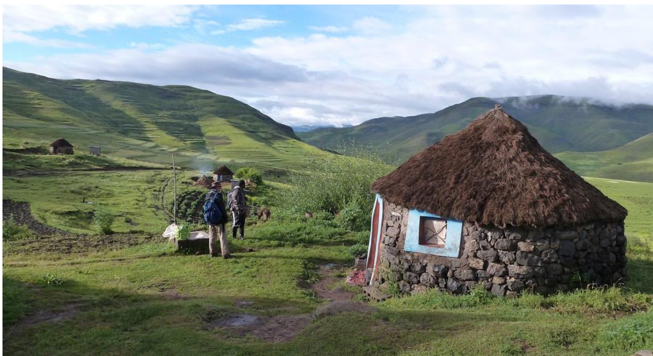
The mountainous landscape of Lesotho.

Small towns are in decline around the world, and this trend is similar in South Africa as rural people migrate to the big cities. In general small town planning in South Africa focuses on a set of almost constant challenges that come together in these small urban places (HIV, poverty and marginalisation, local economic development, food and water insecurity, lack of electrification, environmental issues associated with urban slums) and not on issues such as climate change. Hence, this less likely, but more severe disaster risk from drought is ignored in the planning for South Africa-Lesotho border municipalities. These towns and municipalities are ignoring their potential vulnerability to drought and climate change, and their current disaster management plans show a lack of disaster planning for anything more likely/severe than frosts or fire within their municipalities.