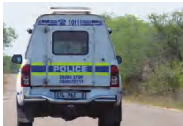
Police vehicle in the Kruger National Park, South Africa

protect national parks” (Moscow Times, 2019). This activity forms part of Russia’s approach to increasing its presence and expanding its influence in Africa. For its part, China supports conservation in Africa as part of its diplomacy. Hence, it is involved in joint law enforcement at the time when Chinese nationals have been blamed for poaching (Zhu & Zhu, 2020). My main point here is that the militarisation