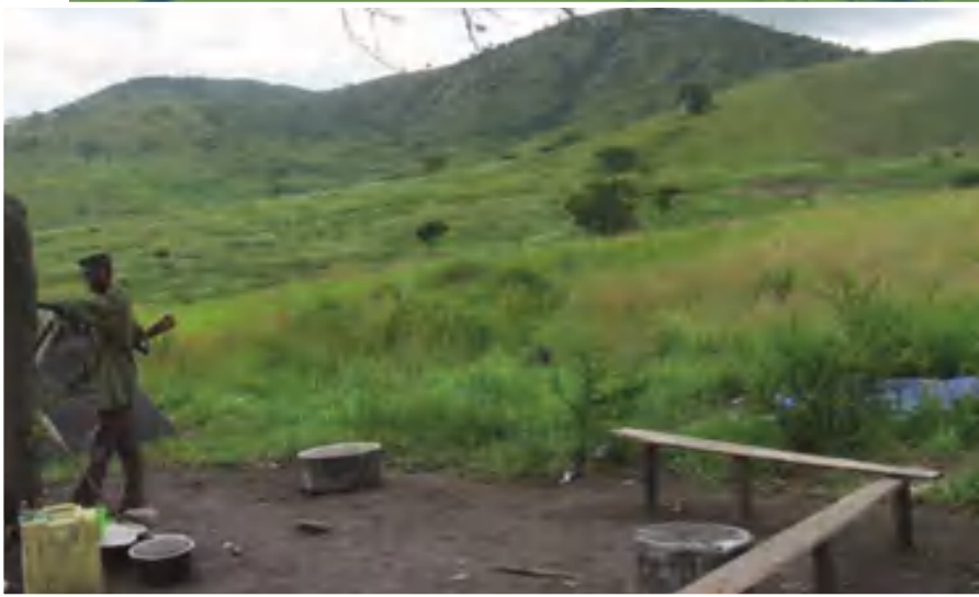
Benches and pots from a rangers' camp in Virunga National Park.