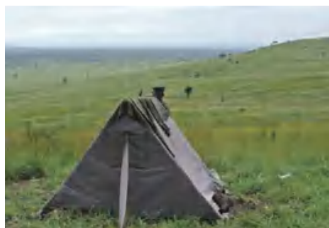
Tent for rangers in Virunga National Park.

Some environmental and land defenders specifically challenge the laws that rangers seek to implement and uphold, for instance, as they have a different vision on how nature, their