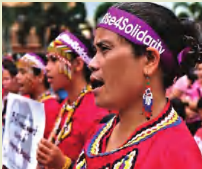
Indigenous women protesting against a mega-project in the Philippines.