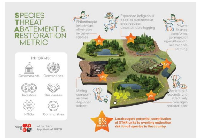
The STAR metric allows business, governments and civil society to quantify their potential contributions to stemming global species loss.

To facilitate such engagement all elements of the framework should be scalable , from local to global levels, and allow anyone to determine their contributions towards global targets. The Species Threat Abatement and Restoration (STAR) metric , co-created by IUCN, can be used to quantify the impact of specific actions in specific places towards halting global species extinctions.