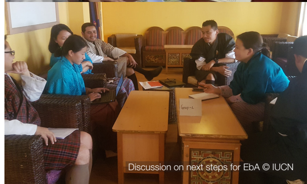
Discussion on next steps for EbA