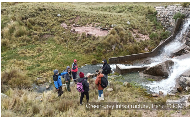
Green-grey infrastructure, Peru