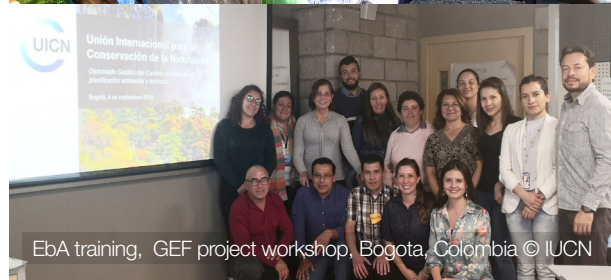
EbA training, GEF project workshop, Bogota, Colombia