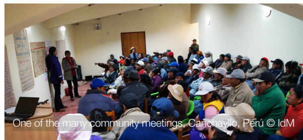
One of the many community meetings, Canchaylo, Perú