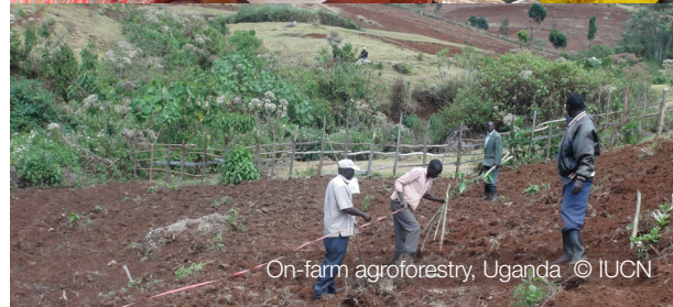
On-farm agroforestry, Uganda