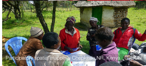
Participatory spatial mapping, Chepkitala NR, Kenya