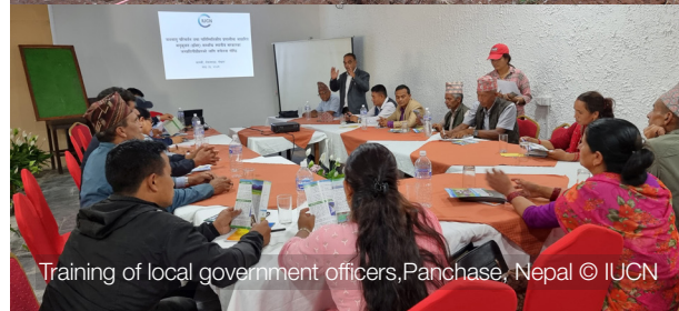
Training of local government officers, Panchase, Nepal