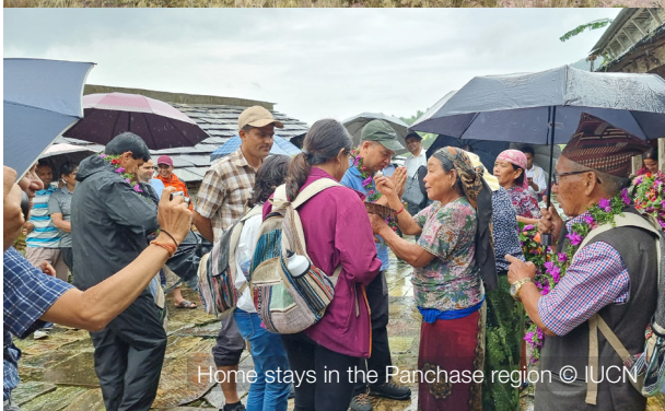
Home stays in the Panchase region