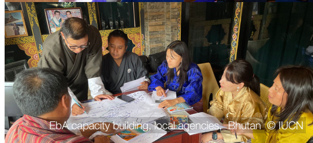
EbA capacity building, local agencies, Bhutan