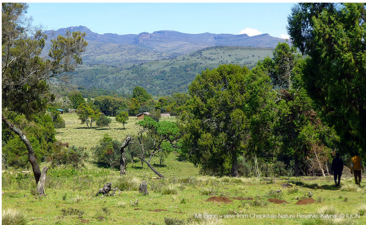
Mt Elgon – view from Chepkitale Nature Reserve, Kenya