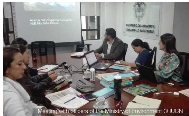
Meeting with officers of the Ministry of Environment