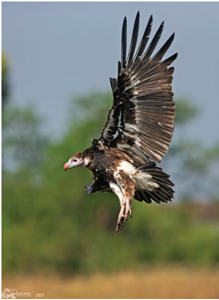
Critically Endangered White-headed Vulture ( Trigonoceps occipitalis ), QEP, Uganda