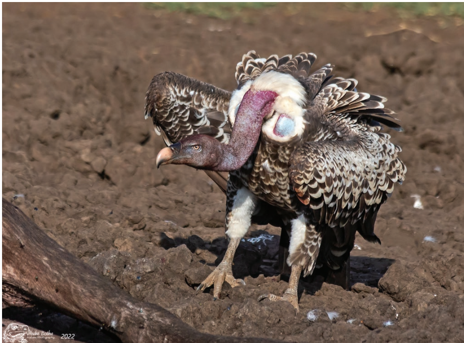
Critically Endangered Ruppell's Vulture ( Gyps rueppelli ), Kidepo NP, Uganda