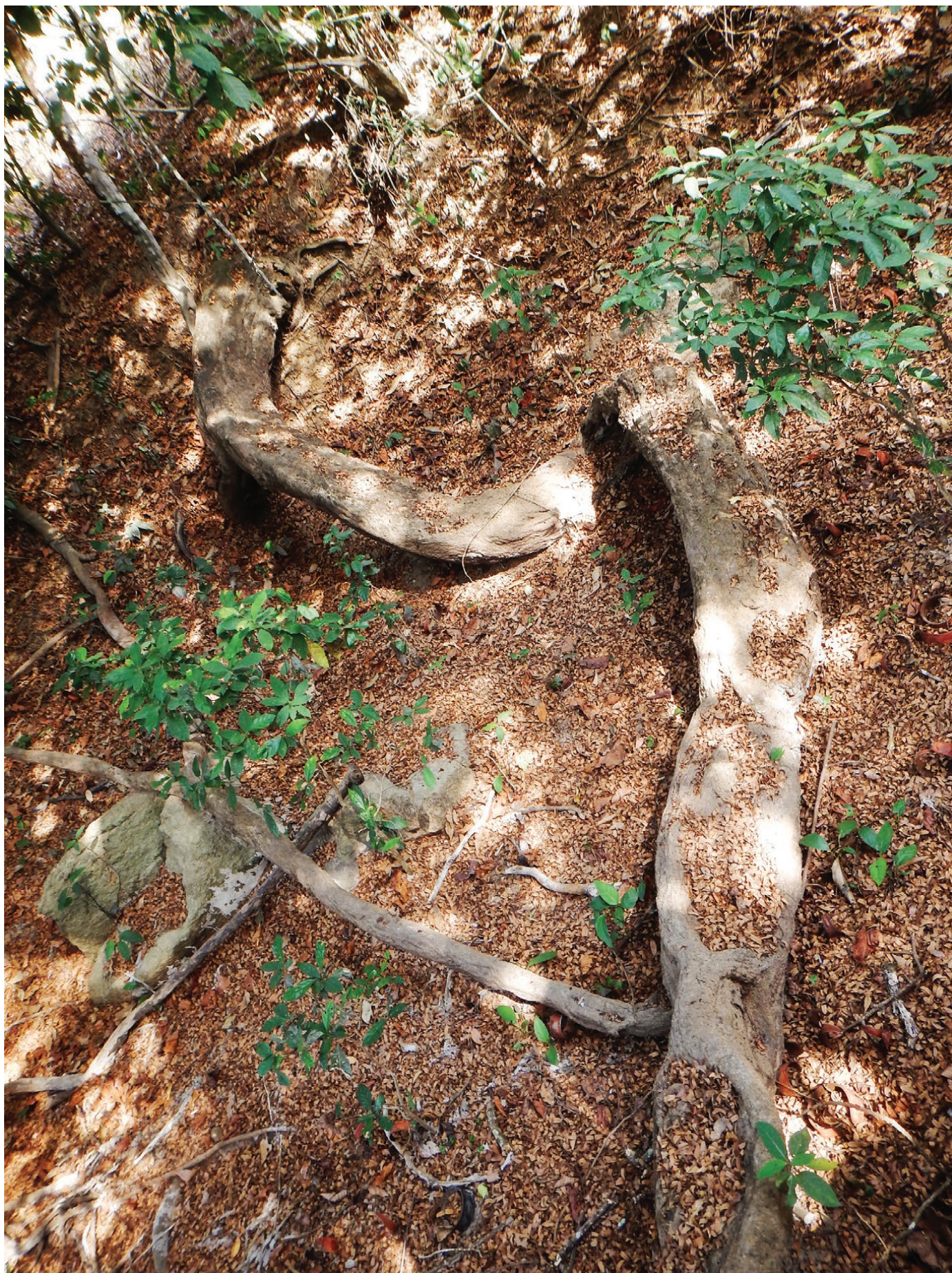
Dalbergia mayumbensis Baker f. (Leguminosae), published in the IUCN Red List of Threatened Species™ with support from the Eastern Africa Plant Red List Authority