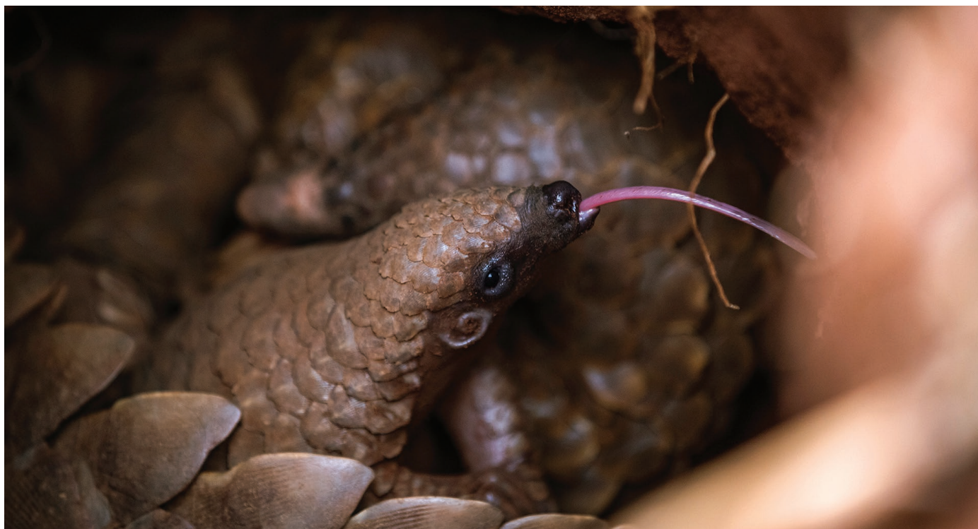
Pangolin pup yawning. This pup was born wild and free after its mother was successfully rescued and released back into the wild – a result of successful collaboration between law enforcement, veterinarians, community members, wildlife monitors, and PSG members in South Africa

T-002 Restructure and refresh the PSG advisory committee by 2022 to more effectively achieve our mission and targets, to be more representative of the regions where pangolins occur, as well as to better provide opportunities for mentorship and capacity building for emerging and future range state PSG leaders.