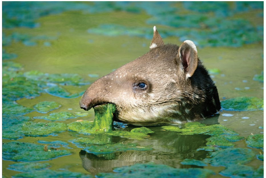
Lowland Tapir, Brazil

Result description: The TSG Fellowship Programme did not operate during the pandemic (2020–2021). We are currently resuming the programme and planning for the second half of 2022 and 2023.