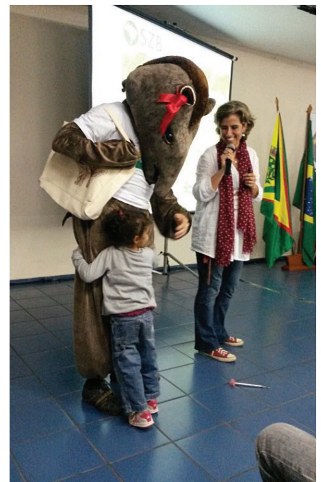
SZB Conference. Keynote Speech My Friend is a Tapir Campaign