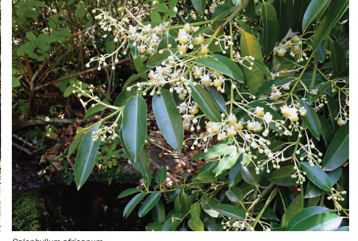
Collecting seed of threatened tree species in Guinea