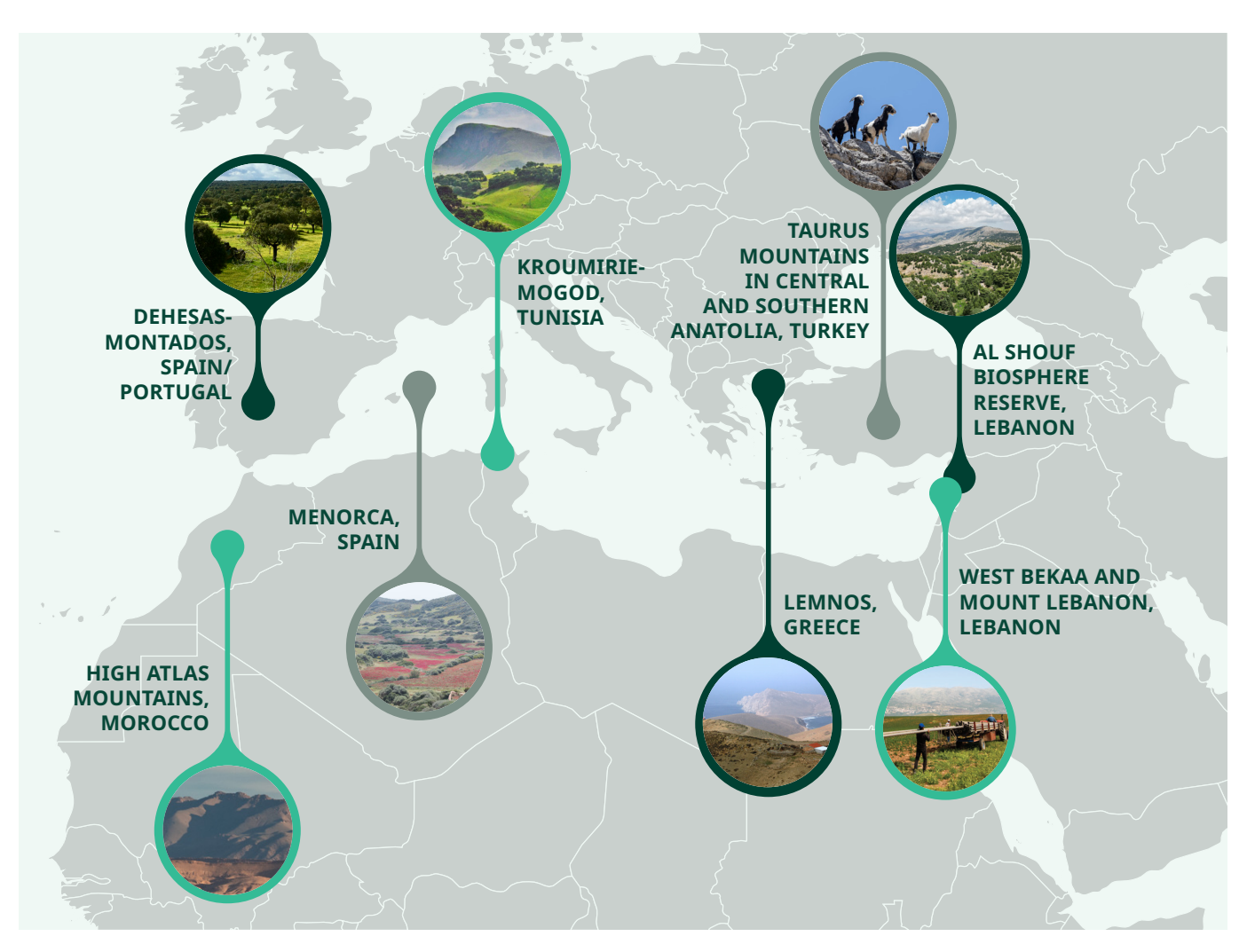
Credits: Dehesas/Montados, Spain/Portugal: © Concha Salguero. Kroumirie-Mogod, Tunisia: ©Ali Yaakoubie. Taurus mountains in Central and Southern Anatolia, Turkey: © Cem Türkel. Al Shouf Biosphere Reserve, Lebanon: © Al Shouf Biosphere Reserve. West Bekaa and Mount Lebanon, Lebanon: © Asaad Saleh. Lemnos, Greece: © MedINA. Menorca, Spain: © GOB Menorca. High Atlas Mountains, Morocco: © Inanc Tekguç.

The boundaries and names shown and the designations used on this map do not imply any official endorsement, acceptance or opinion by IUCN or the experts and partner organisations that contributed to this work.