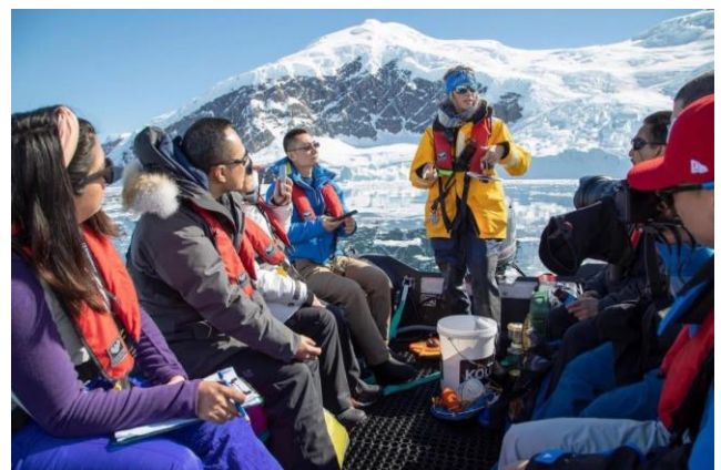
Tourists participating in the FjordPhyto citizen science project. Tourist vessels also help scientists access their research sites.

The long-term positive effects of the Antarctic tourist experience on visitors’ behavior should also be evaluated.