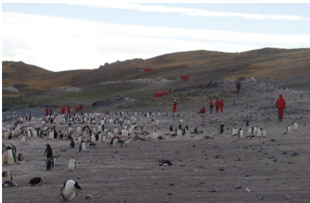
Tourists interacting with a Gentoo penguin ( Pygoscelis papua ) colony at a popular visitor site

On the other hand, Antarctic travel has a high carbon footprint. Tourist activities can also cause damage at visitor sites and along travel routes, and disturb wildlife . For example, research has shown that tourist activities are causing penguin species to change their reproductive and social behaviours.