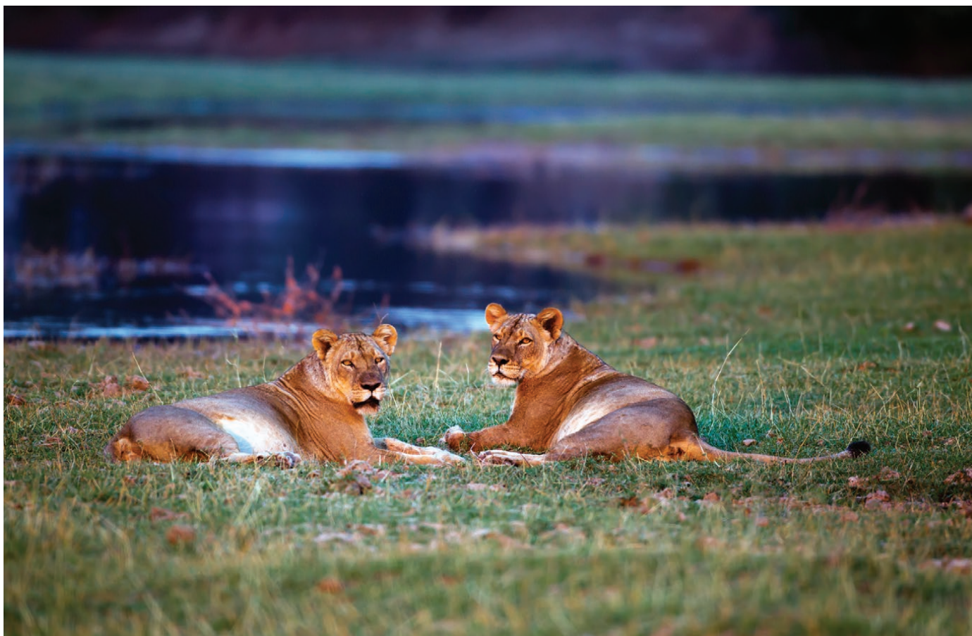
African lion

T-028 Maintain and expand the Cat Specialist Group Species Database (CSGSD).