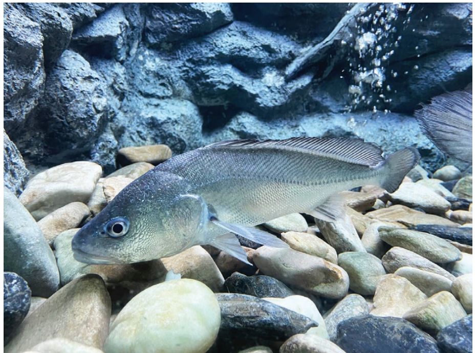
Boesemanina microlepis aquaculture is still in experimental phase

Artisanal marine fisheries provide household income and food supply in tropical America and Asia, representing the most important activity in large marginal communities along the coast. These fisheries occur daily throughout the year with commercial sizes and juveniles of sciaenid species as primary targets. However, low importance undersize species without natural commercial value represent a significant bycatch, mostly in shallow, brackish and estuarine water environments. To date, official statistical records for the artisanal fisheries along the Meso- and South American coast and Southeast Asia region are deficient in accurately establishing fisheries production targets, regulations and conservation strategies.