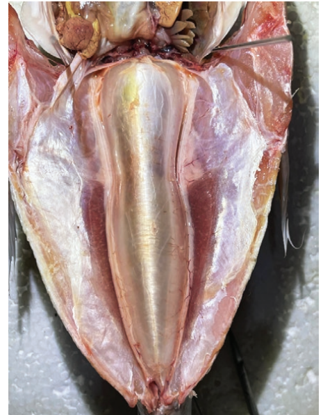
The beauty of the Boesemanian microlepis swim bladder