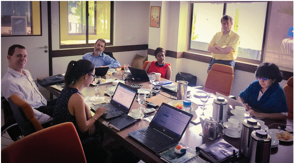
IUCN Strategy Planning meeting, November 2017