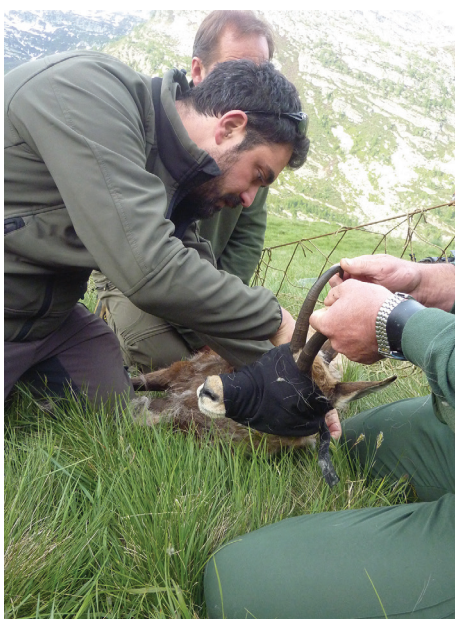
Radiotagging Alpine chamois ( Rupicapra rupicapra )