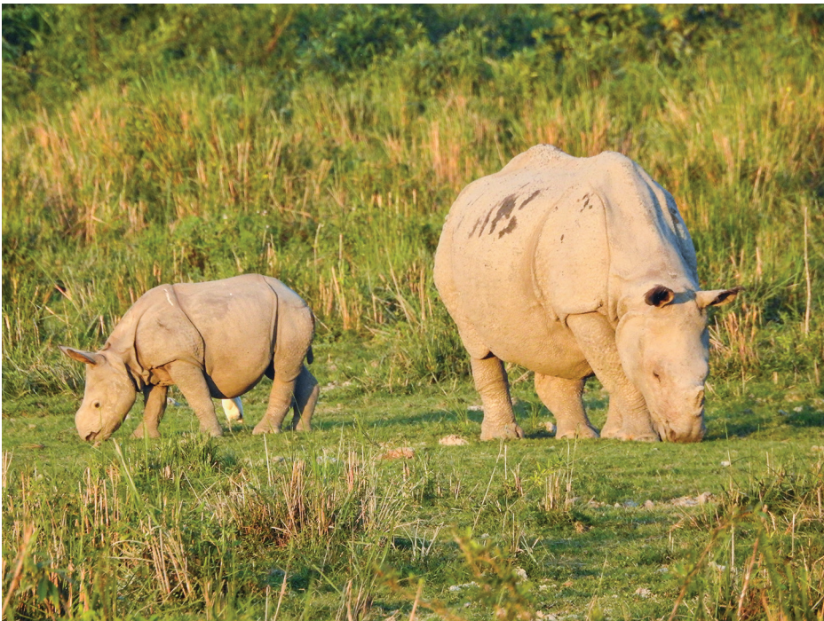
Greater One Horned Rhino