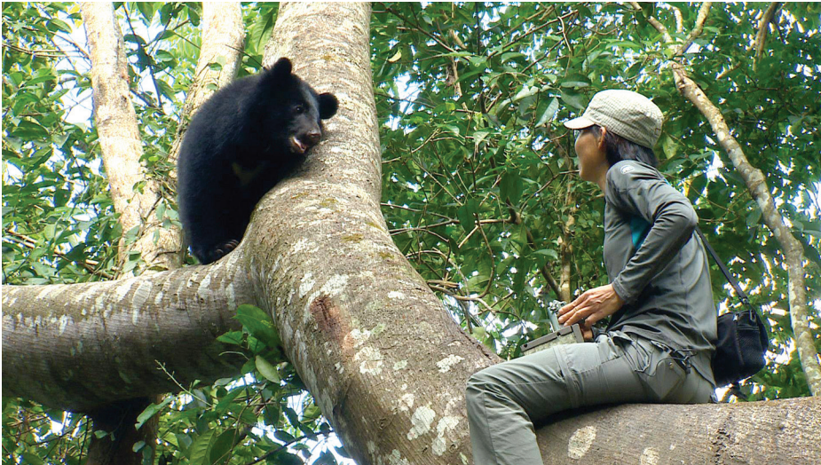
An orphaned Asiatic black bear cub in Taiwan was rehabilitated in captivity and prepared for release back to the wild