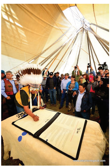
Northern Buffalo (Iinnii) Treaty Tribes signing

Bison bison at Yellowstone National Park