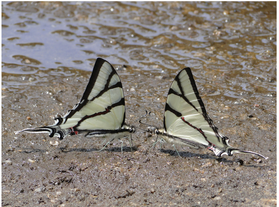
Eurytides bellerophon (Papilionidae), Least Concern