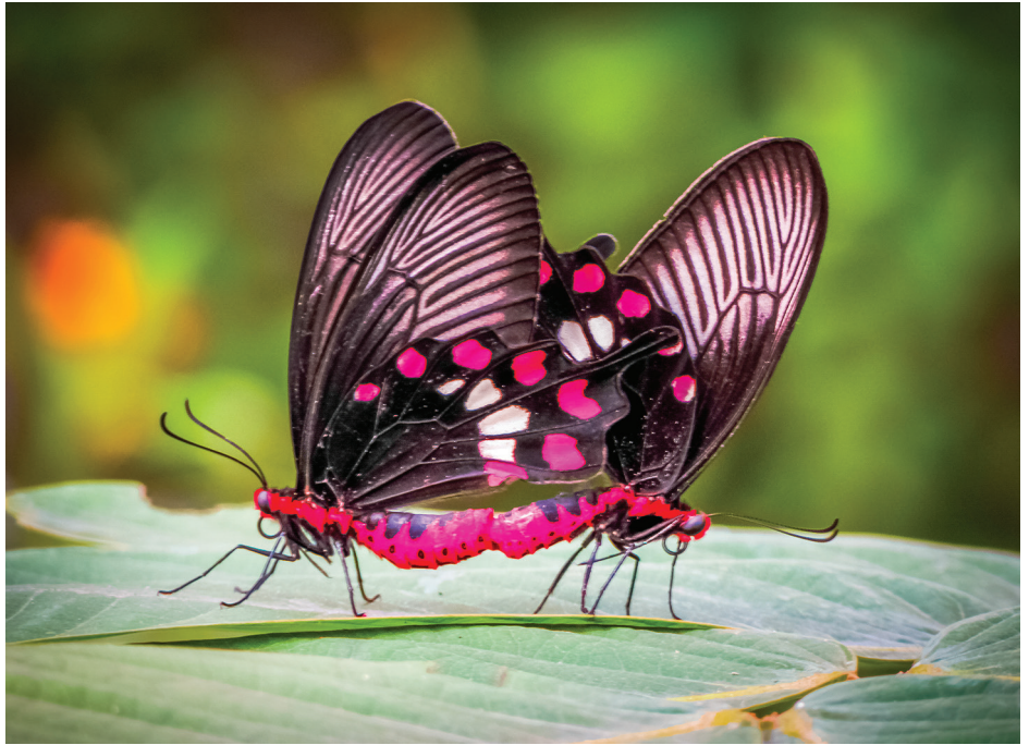
Atrophaneura aristolochiae, Common Rose (Papilionidae), Least Concern