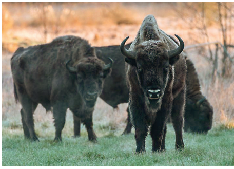
European Bison