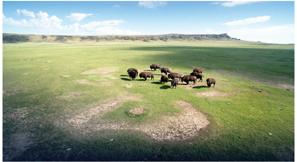
Bison at Snake Butte, Fort Belknap Reservation, Montana