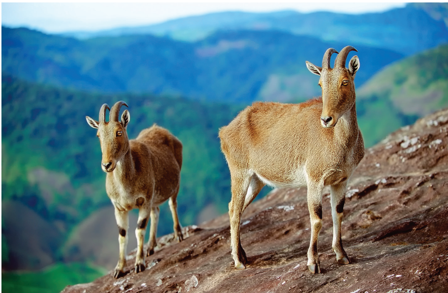
Two subadult females of Nilgiri tahr