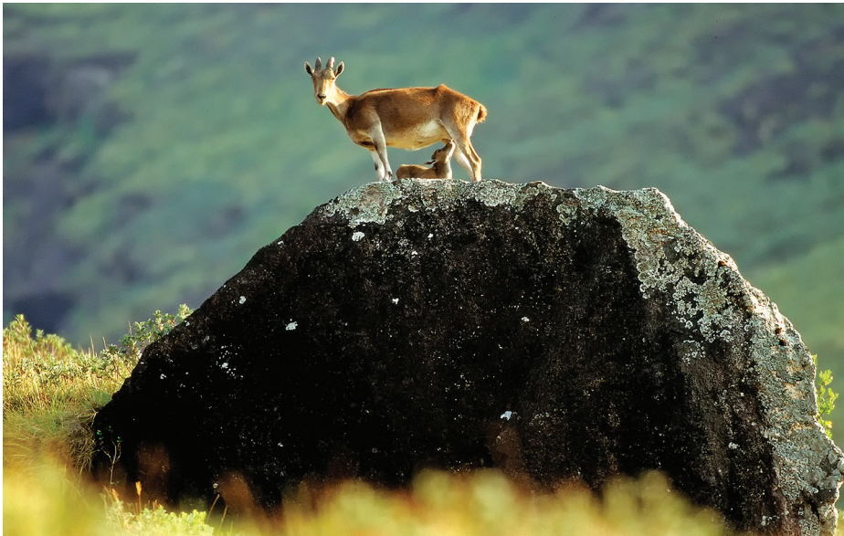
A Nilgiri tahr suckling