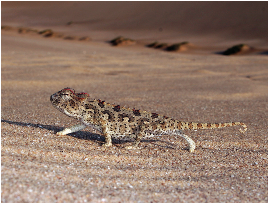
Least Concern Namaqua Chameleon, Chamaeleo namaquensis