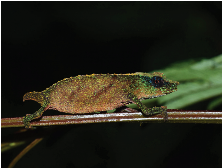
Critically Endangered Chapman's Pygmy Chameleon, Rhampholeon chapmanorum