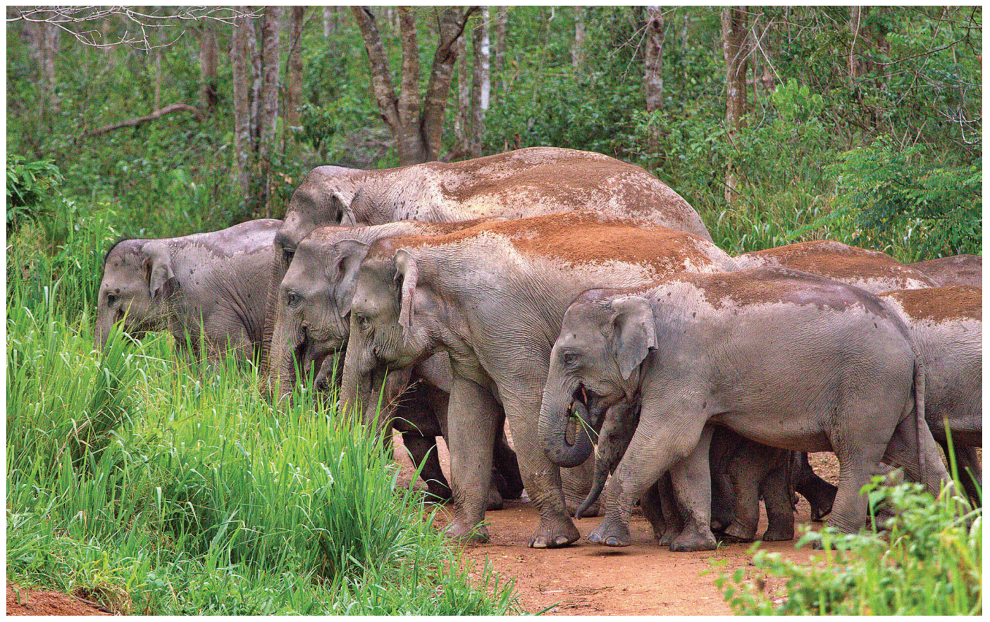
Elephant herd in Thailand forest