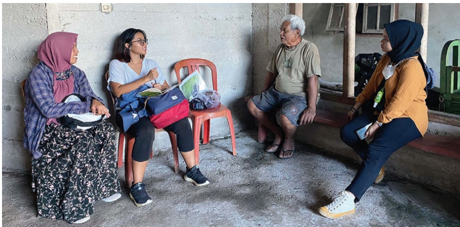
ASAP Partner PROGRES engaging with the local community as part of their Talaud Bear Cuscus conservation outreach efforts