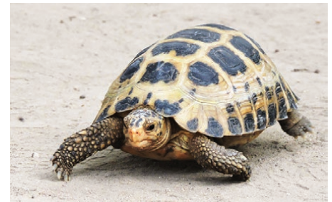
Forsten's Tortoise ( Indutestudo forstenii ) from Central Sulawesi