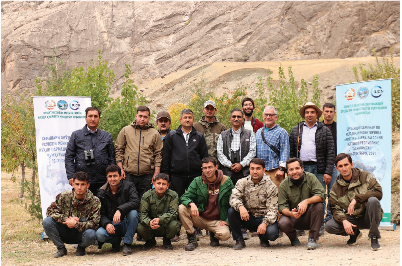
Caprinae Specialist Group mission to Tajikistan to advise on markhor Capra falconeri conservation