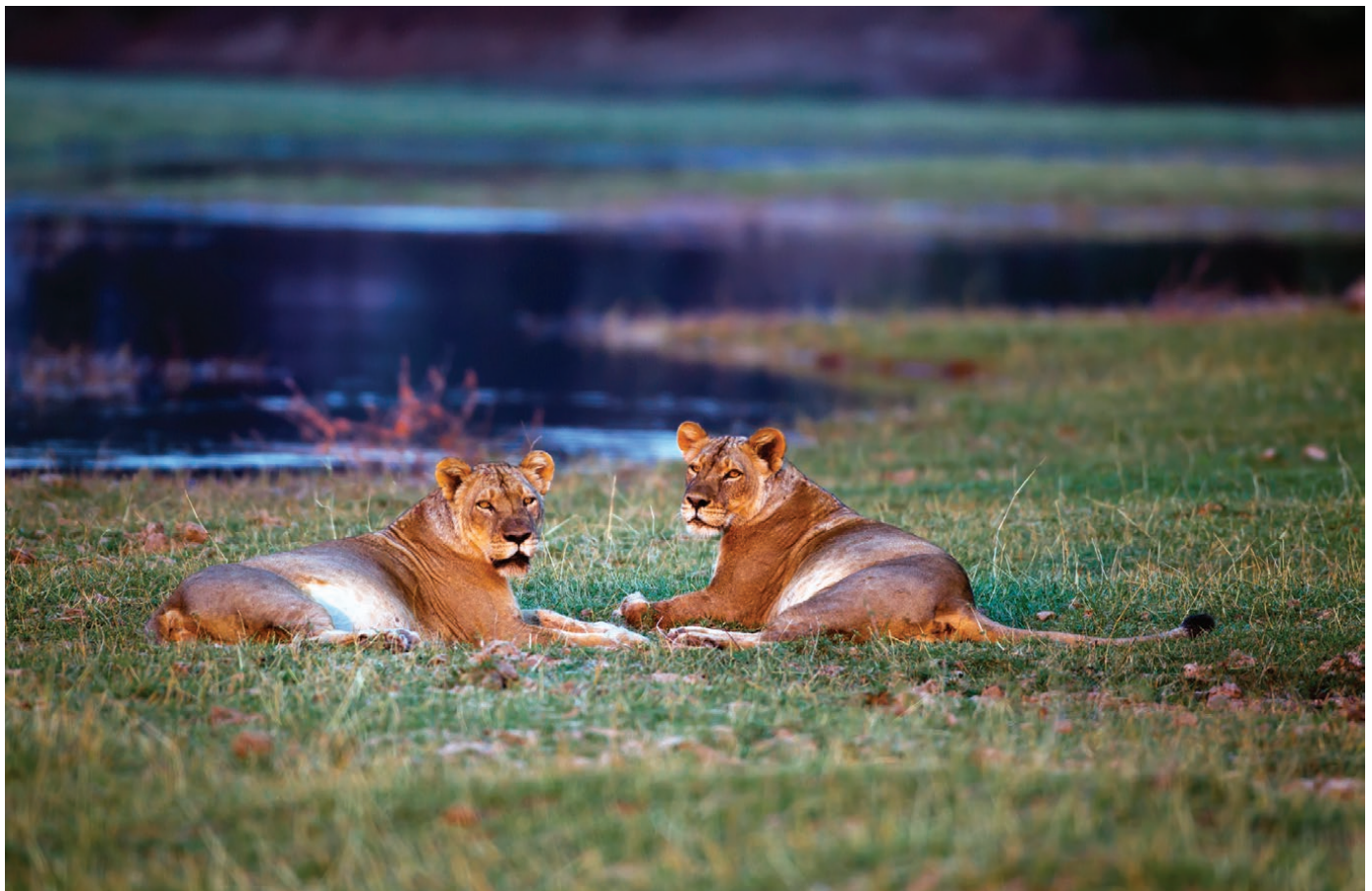
African Lion ( Panthera leo)

T-028 Maintain and expand the Cat Specialist Group Species Database (CSGSD).