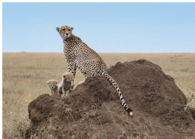
Cheetah ( Acinonyx jubatus )