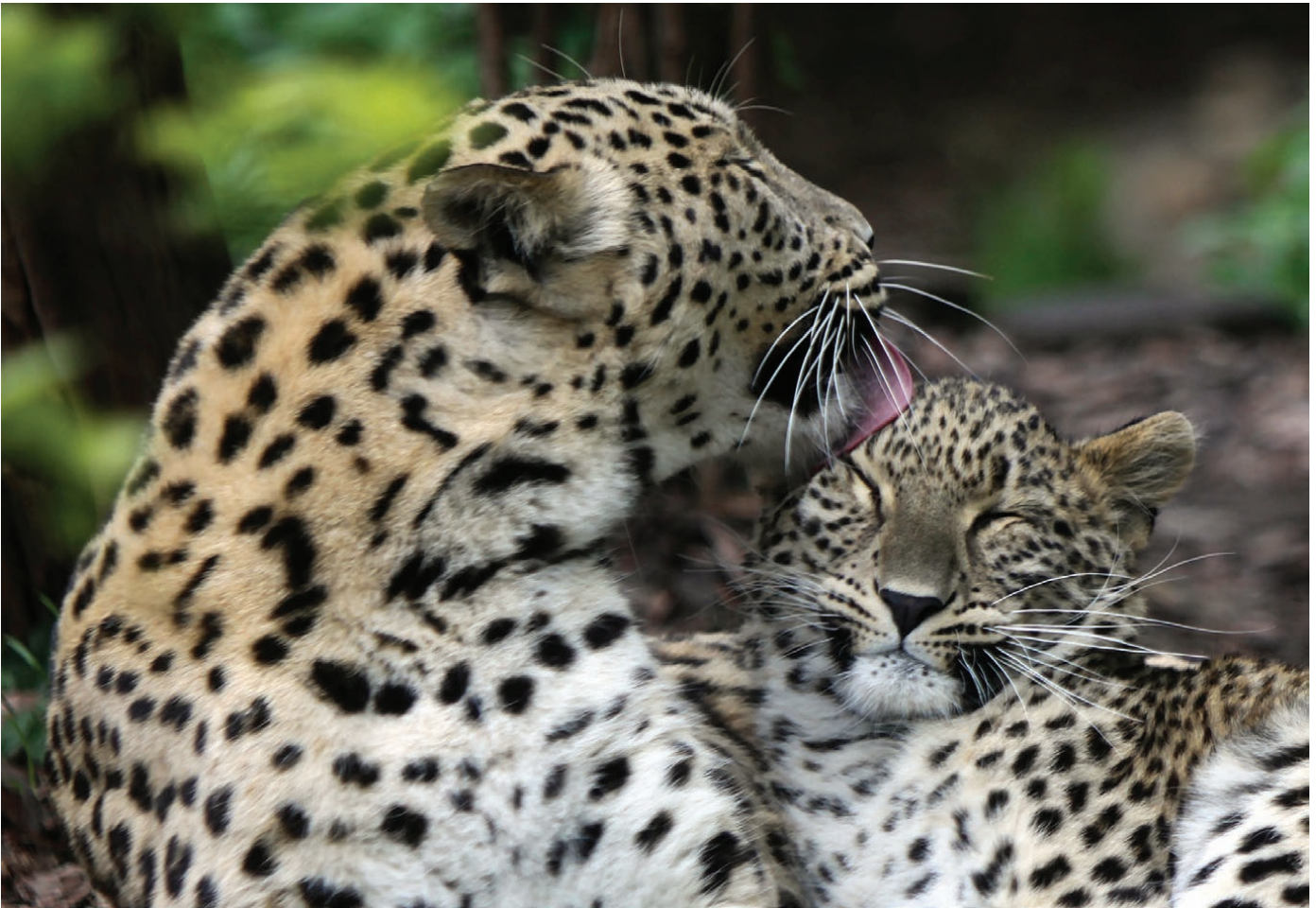
Persian Leopard ( Panthera pardus tulliana)