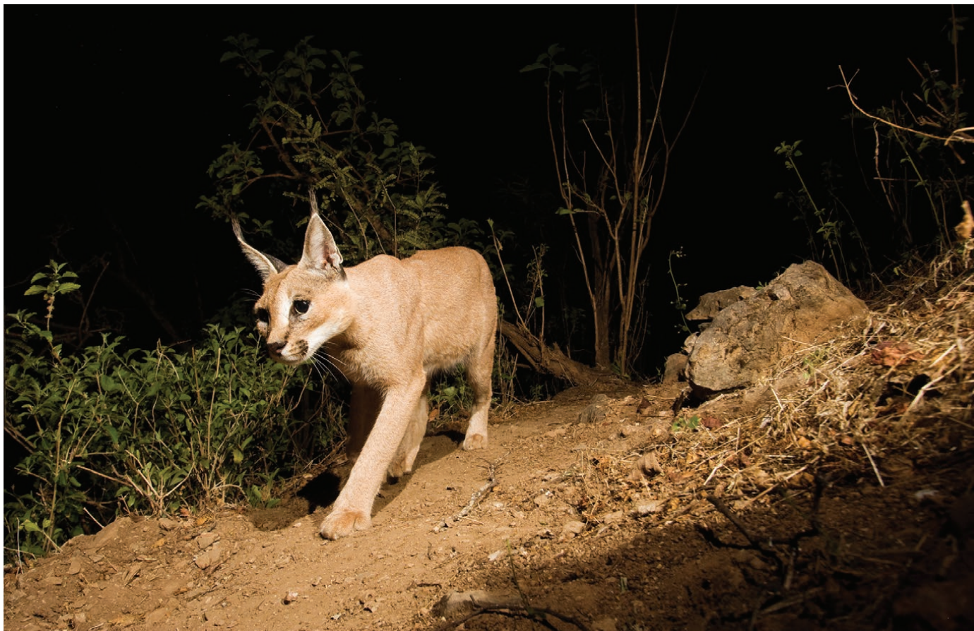
Caracal ( Caracal caracal )

T-049 Explore in a discussion with the whole group, and adapt if desired, the internal structure and organisation of the Cat Specialist Group, e.g. geographic subgroups, taxonomic or topical working groups, specific task forces, etc. Status: On track