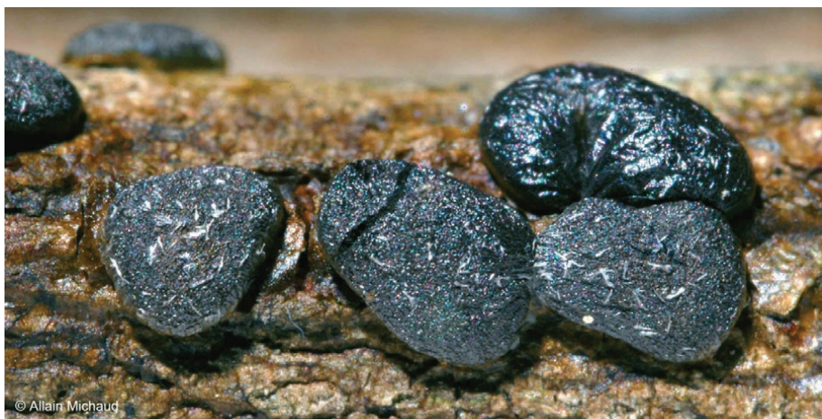
Diacheopsis kowalskii