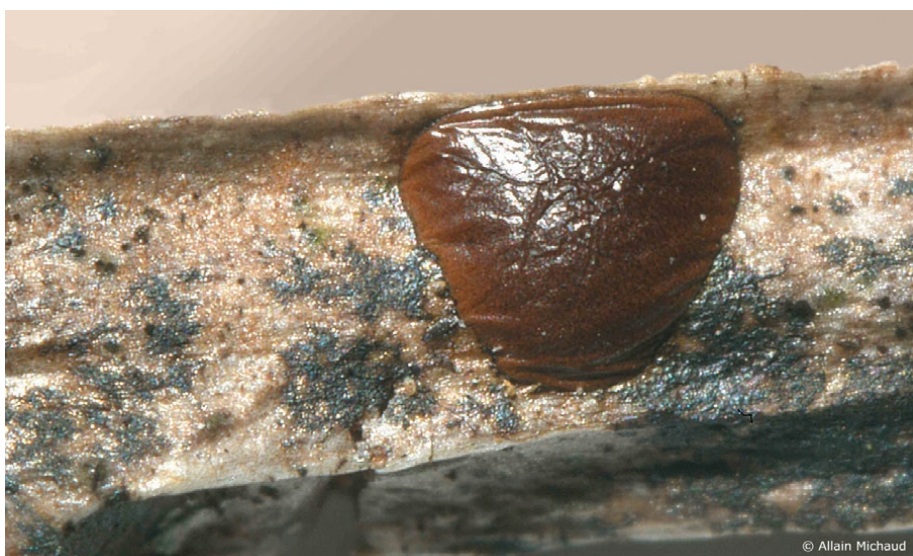
Dianema inconspicuum

species of fungi and myxos as part of the project 'Implementation of actions of the Strategy for the Conservation of Fungal Diversity in Cuba'; (6) two conferences held; (a) Conference 'Avances en la evaluación del estado de conservación de especies fúngicas (hongos y mixomicetes): experiencias en Cuba' in III Winter School and VII Microbial ecology workshop (Havana), and (b) Conference 'IUCN criteria and categories applied in the evaluation of the conservation status of fungal species' in the workshop of the Project Implementation of actions of the Strategy for the Conservation of Fungal Diversity in Cuba.