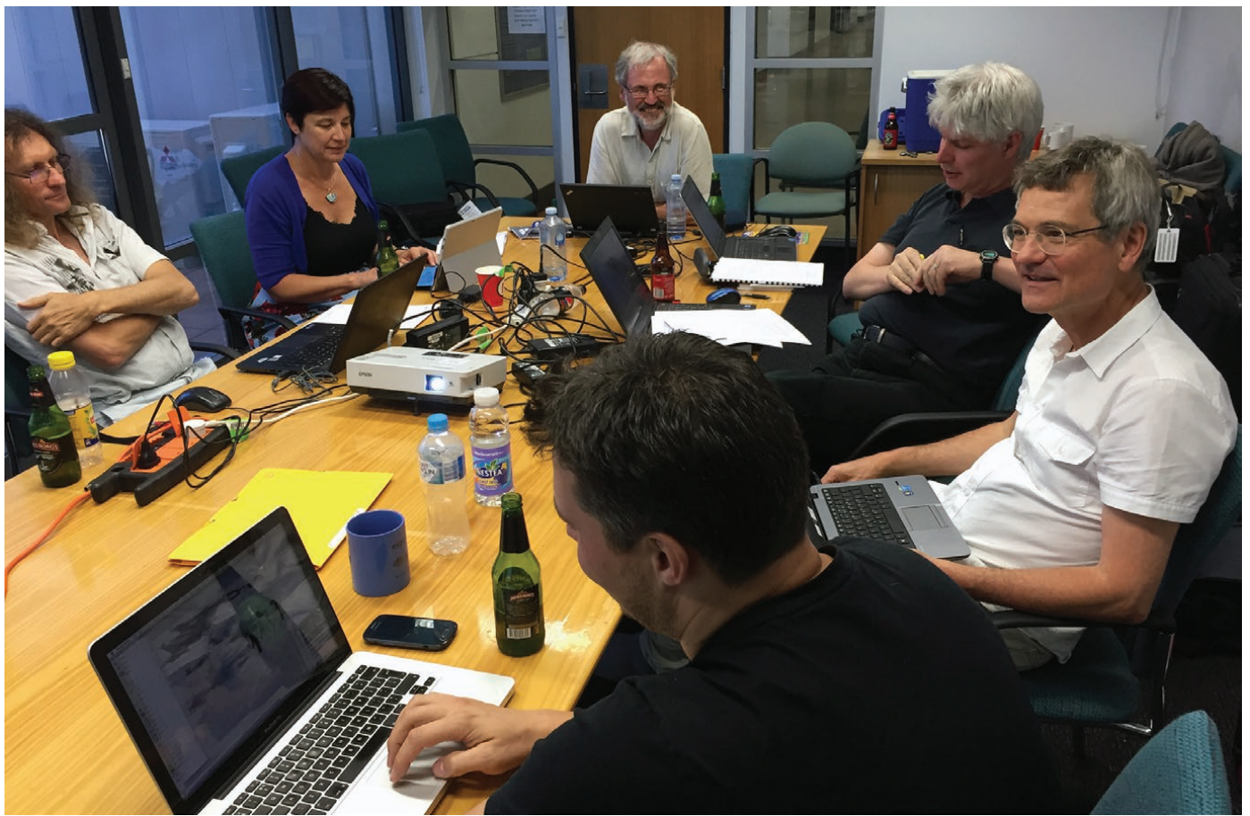
Standards and Petitions Committee at a meeting in November 2015 at the University of New South Wales, Sydney, Australia