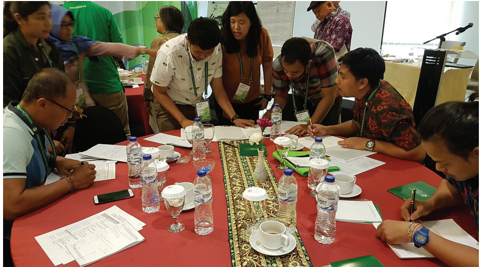
Training in Indonesia on facilitating species conservation planning workshops