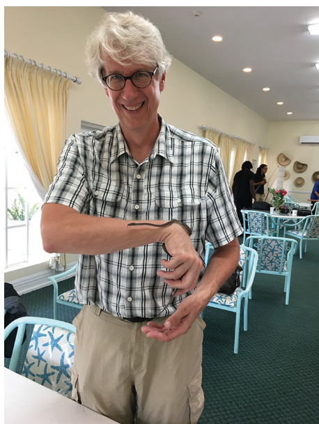
Snake interaction at the Conception Bank silver boa conservation planning meeting