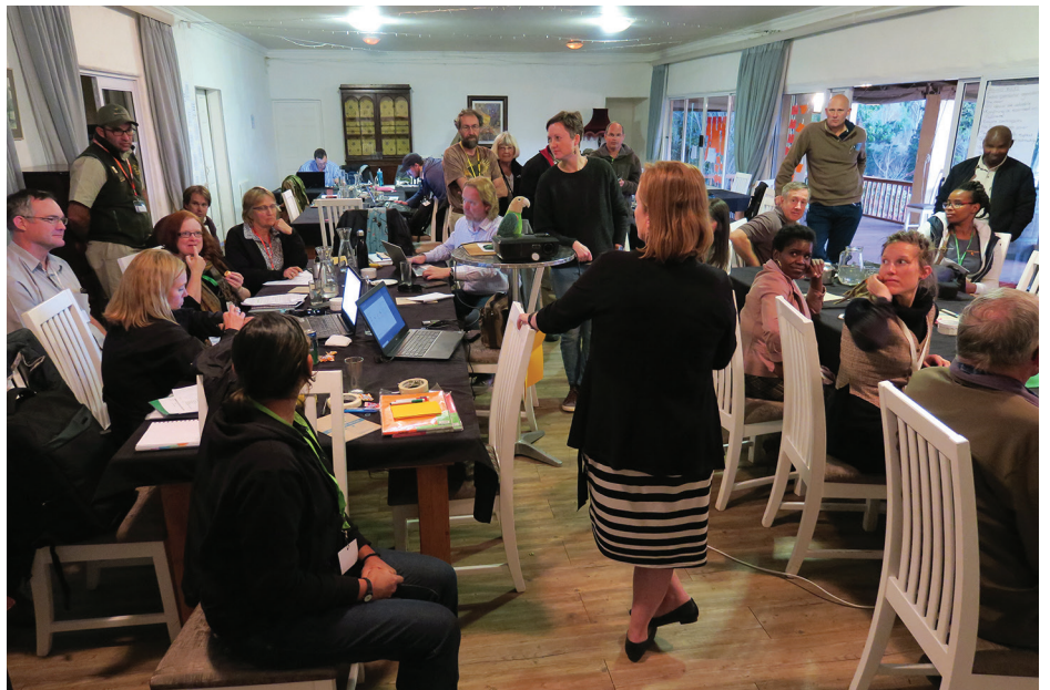
Facilitating action planning for South African Cape parrots

Technical advice: (1) provide a generic process for species prioritisation for planning, adaptable to a range of relevant situations; (2) increase the rate of conservation planning (number of species with identified conservation needs and actions); (3) explore opportunities to strengthen the tools and processes used for single-species conservation planning activities; (4) develop a suite of planning tools and templates that can be applied to planning activities for multiple species on a landscape; (5) contribute to enhancing the SSC Species Conservation Planning Guidelines; (6) increase the value to SSC planning of the IUCN SSC Species Conservation Planning Tools Library; (7) create a facilitation skill sub-section of the species conservation planning processes tools library; (8) within our area of influence, develop a clear and practical response to the challenge countries face in achieving Biodiversity Targets; (9) assist governments to use the SSC species conservation planning process to help them meet their obligations under Target 12 of the Convention on Biological Diversity 2020 Strategic Plan; (10) play a meaningful role in influencing the next iteration of biodiversity targets, post-2020, ensuring that species conservation planning is included in the next set of internationally agreed biodiversity conservation targets; (11) CPSG to expand capacity in Southeast Asia.